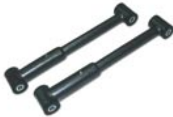
Original Flex Arms (FATJ)

NOTE: These instructions apply to the original flex arms and the new modular flex arms.