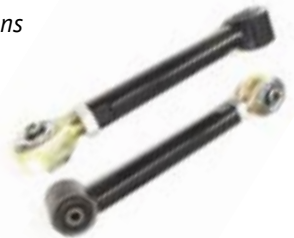
Modular Flex Arms (4002)

NOTE: These instructions apply to the original flex arms and the new modular flex arms.