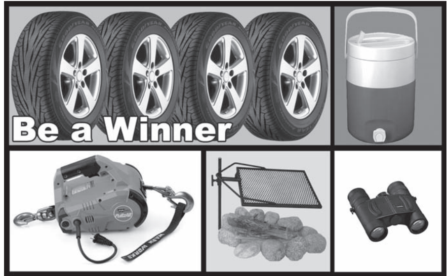
Watch for your renewal notice this year! All renewing members are entered to score some great prize packages.

This package contains a Coleman Road Trip Party Grill, a Two-in-One Packaway Lantern, a Two-Gallon Jug, a 16-Qt. Excursion Cooler, and a big Event 14 Tent with a Sun Shield.