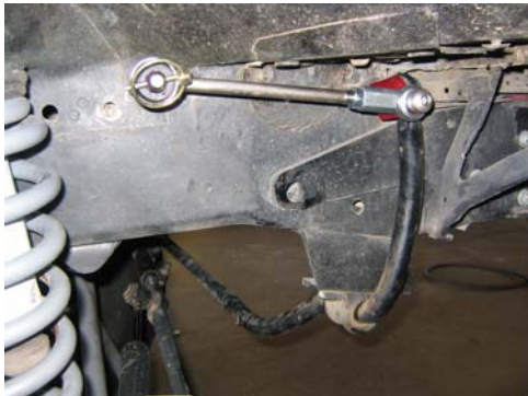
MOUNTING ORENTATION FOR ALL XJ & ZJ'S WITH RE SWAY BAR RELOCATION BRACKETS (P/N RE921)