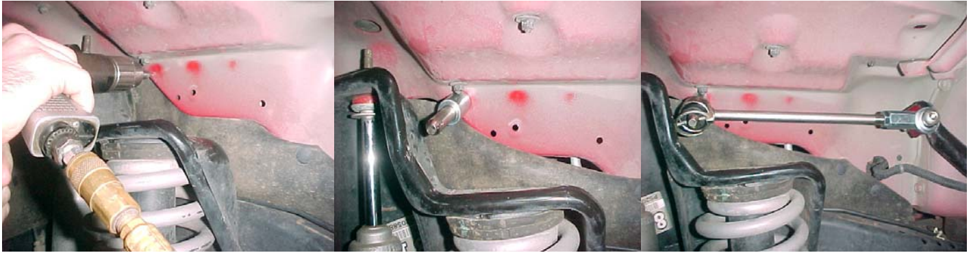
PICTURE -A- MOUNTING PIN HOLE LOCATION & MOUNTING ORENTATION FOR ALL TJ'S

NOTE- ABOVE IMAGE SHOWS 11" DISCONNECTS (P/N RE1142, FOR 4.5-5.5" LIFTS) FOR 2-3.5" LIFTS, 9" DISCONNECTS ARE USED (P/N RE1141), MOUNT PIN APPROX 2" FORWARD FROM ABOVE POSITION FOR 0-2" LIFTS, 7" DISCONNECTS ARE USED (P/N RE1140), MOUNT PIN APPROX 4" FORWARD FROM ABOVE POSITION