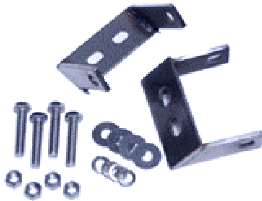
Rear Cross Member