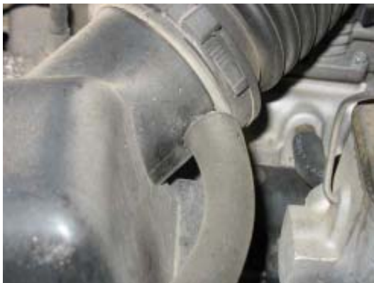
c) Remove the rubber hose connecting the hard plastic charcoal canister hose to the air filter housing.