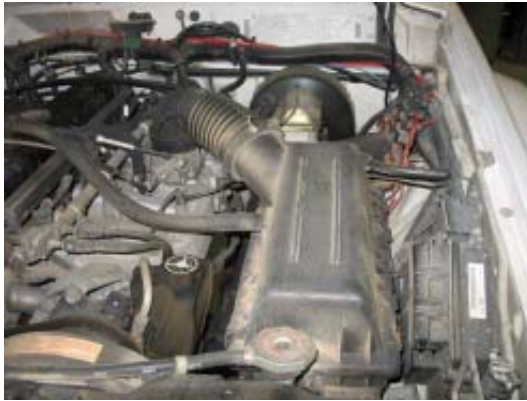
a) Stock intake system.