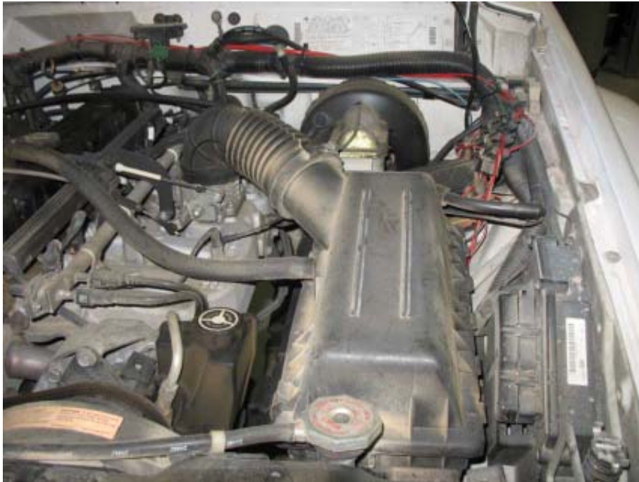
Stock Intake System

k) Install the AEM Dryflow air filter onto the end of the pipe. Push the filter over the pipe until the stop in the filter is reached. Use a #48 clamp to secure the filter onto the intake pipe.