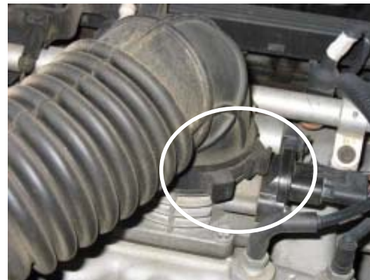
d) Loosen the hose clamp on the throttle body. This is done by simply pulling outward on the plastic hose clamp grips.