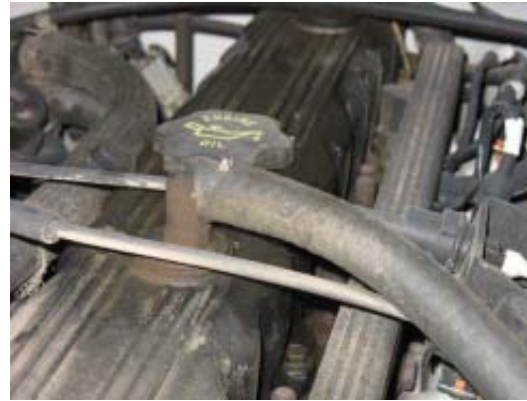
b) Remove the breather hose between the air filter housing and the valve cover.