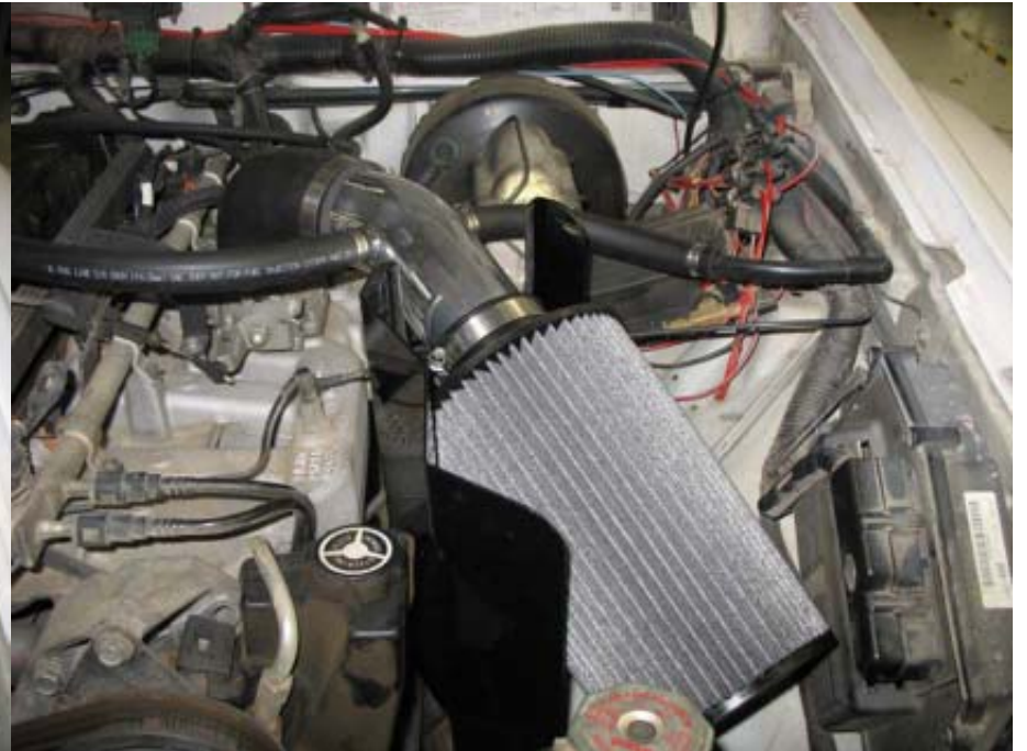
AEM Brute Force Intake Installed