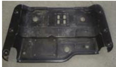
Typical skid plate modifications necessary on '97-'02 vehicles.

gram 1). Trim the plate and place the brackets and arms on top to be sure there is enough clearance, cycle the arms through it's full range of movement to make sure that enough material is removed from the skid plate.