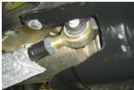
Typical skid plate modifications necessary on '03-current vehicles.