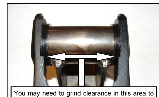
You may need to grind clearance in this area to allow the BombProof™ mount to fit into the factory "fork". More common on YJ's.

Please read and understand all instructions before beginning the installation of these motor mounts. Please read the terms and policies on the back of these instructions.