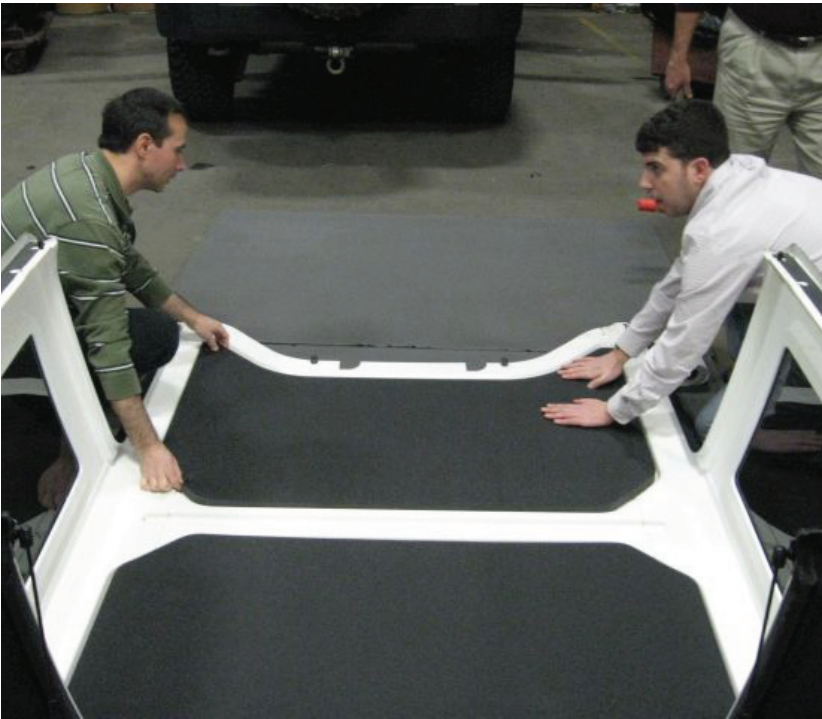
Figure 3. Lay panel in place by applying gentle pressure

4.) Remove the paper release liner from the back of the part about to be installed. Once the liner is removed, center one side as shown in Figure 2.