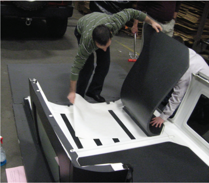
Figure 2. Center part from one side

4.) Remove the paper release liner from the back of the part about to be installed. Once the liner is removed, center one side as shown in Figure 2.