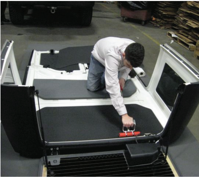
Figure 4. Apply pressure with roller

6.) Once the parts have been installed, apply pressure with a roller as shown in Figure 4 below. Note – Roll the part on in two directions (upwards / downwards and left /right) Note: Flooring roller shown, can use Boom Mat Installation Roller Part # 050218 or press in place by hand.