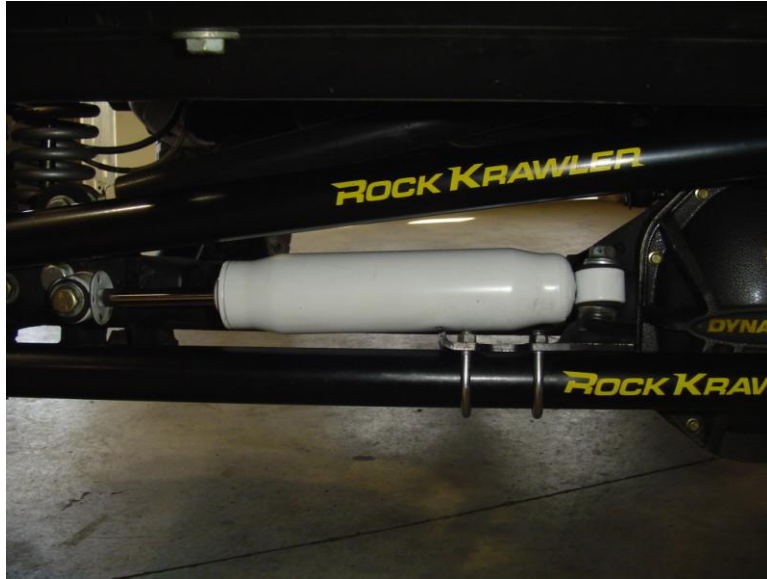
Example of Steering Stabilizer Relocation

11) Make sure to take your JK to the local Jeep Dealer to get aligned so the tow is set properly. Any adverse tow settings could cause unwanted ESP activation. Be sure to lock the jam nuts in place with thread locker like loctite when all is said and done.