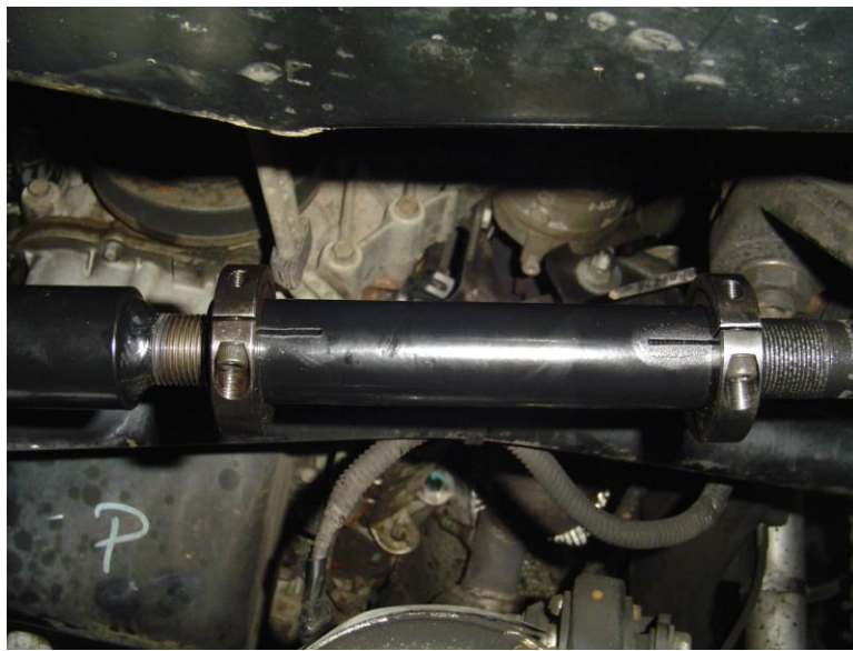
Quick Adjuster with Shaft Collars Installed

12) Make sure to take your JK to the local Jeep Dealer to get aligned so the steering wheel is properly centered. This way you will not run into issues with ESP controls! Be sure to lock the jam nuts in place with thread locker like loctite when all is said and done.