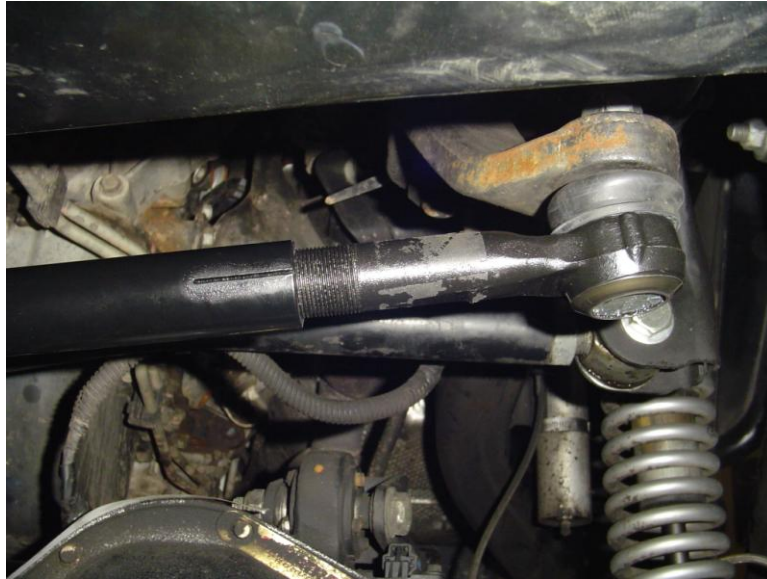
Pitman Arm Ball Joint Connections