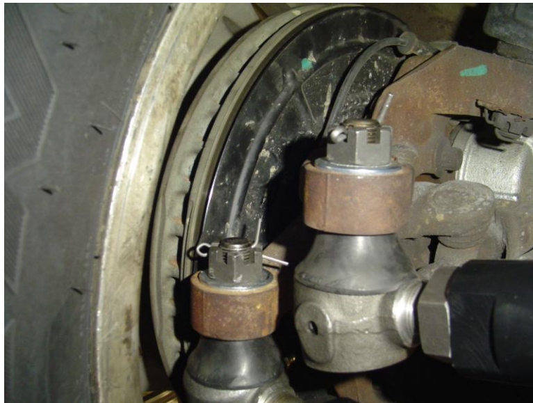
P.S. Knuckle Connections