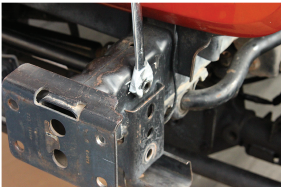
Step 2: Photo Two: Havng placed tape on wrench and inserting Nut, slide wrench placing nut in position.