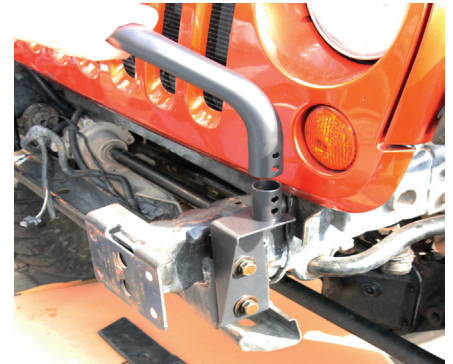
Step 3: Photo Four. Slide light bar onto tube welded to mounting bracket.