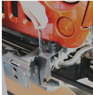
Step 2: Photo Three. Picture of bracket being fasten to frame