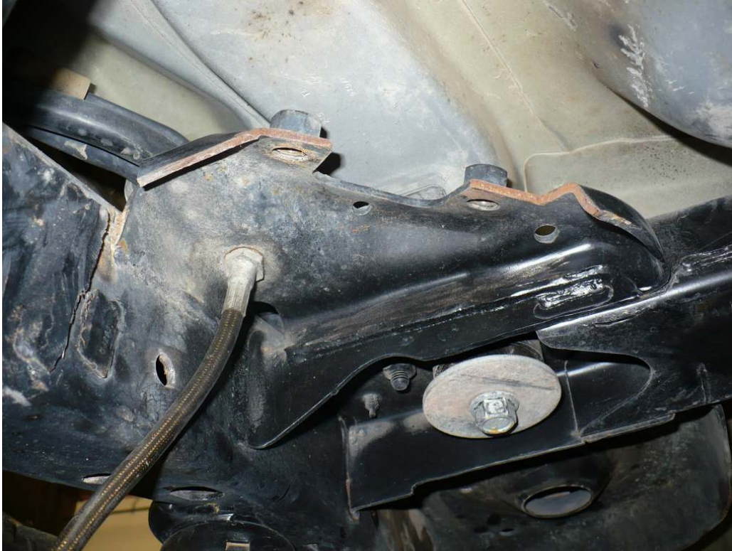
Picture 2.2 Example of properly trimmed stock shock mount