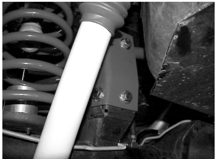
Rear Trackbar Bracket (installed) driver side view

Place new trackbar relocating bracket over the OEM trackbar mount at differential. Place the new 12mm x 70mm bolt through the original trackbar location. Use the supplied spacer (#54314) to fill the space where the OEM track bar was located. Apply lock nut and tighten. Drill a 1/2" hole through the hole in the driver's side of the new bracket. Install the 1/2" x 1 1/4" bolt with washers on each side through the newly drilled hole and tighten with self locking nut. Install the 5/16" x 1" fine thread bolt, washers and nut into the forward hole of the new bracket. Place the trackbar into the upper hole of the new bracket using the original hardware and tighten once vehicle has been lowered to the ground.