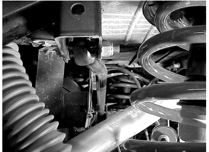
Rear Trackbar installed (notice the location of the bend)