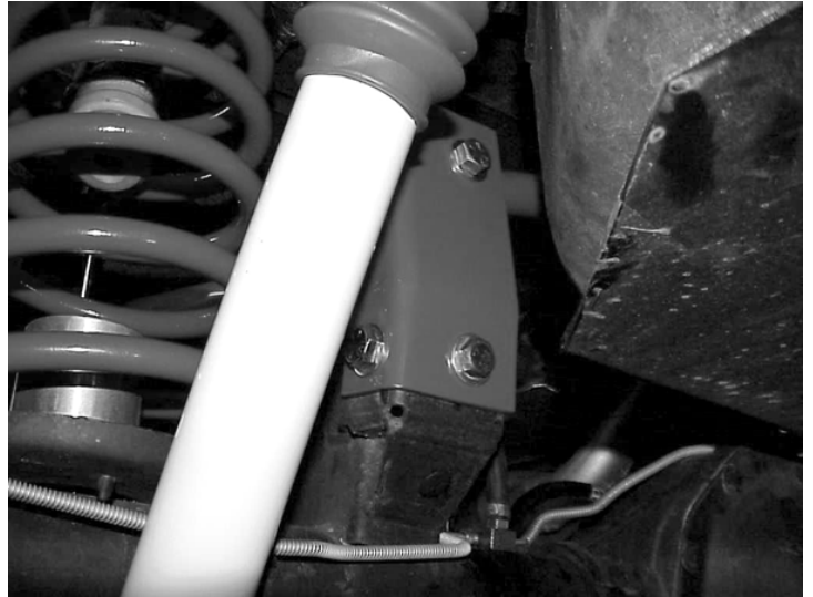
Rear Trackbar Bracket (installed) driver side view

Place new trackbar relocating bracket over the OEM trackbar mount at differential. Place the new 12mm x 70mm bolt through the original trackbar location. Use the supplied spacer (#54314) to fill the space where the OEM track bar was located. Apply lock nut and tighten. Drill a 1/2" hole through the hole in the driver's side of the new bracket. Install the 1/2" x 1 1/4" bolt with washers on each side through the newly drilled hole and tighten with self locking nut. Install the 5/16" x 1" fine thread bolt, washers and nut into the forward hole of the new bracket. Place the trackbar into the upper hole of the new bracket using the original hardware and tighten once vehicle has been lowered to the ground.