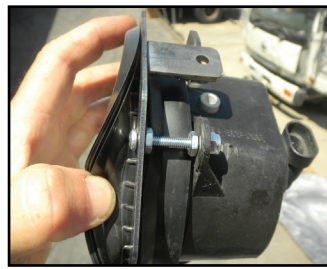
Faceplate hardware assembly.