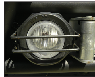
Light Guard shown installed.