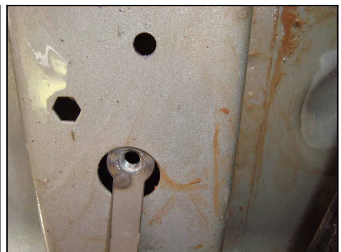
FIGURE 5 FIGURE 6