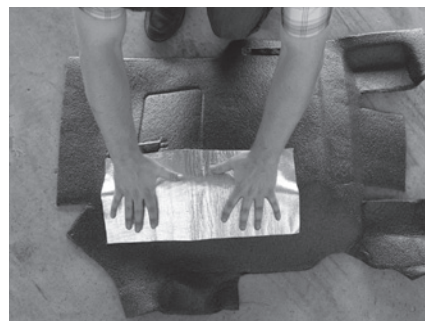
FIGURE 4: DRIVERS SIDE