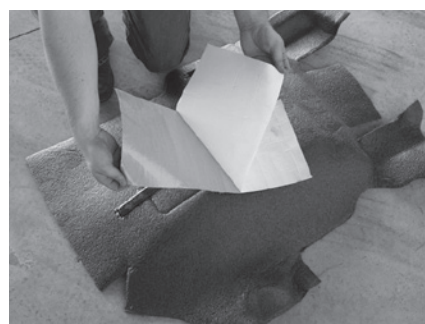
FIGURE 3: DRIVERS SIDE