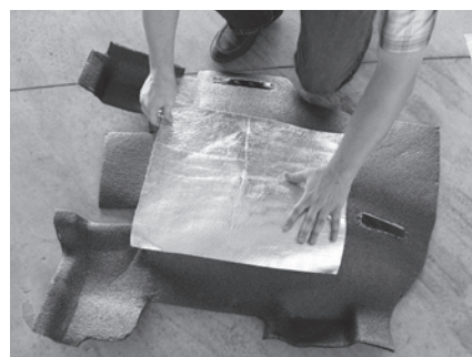
FIGURE 2: PASSENGERS SIDE