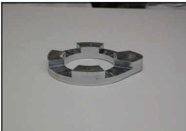
Config. A = 1.0" Lift