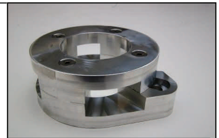
Config. C = 2.0" Lift

Assemble the desired amount of lift ( 1.0", 1.5", 2.0" ) based on the vehicle's stance.