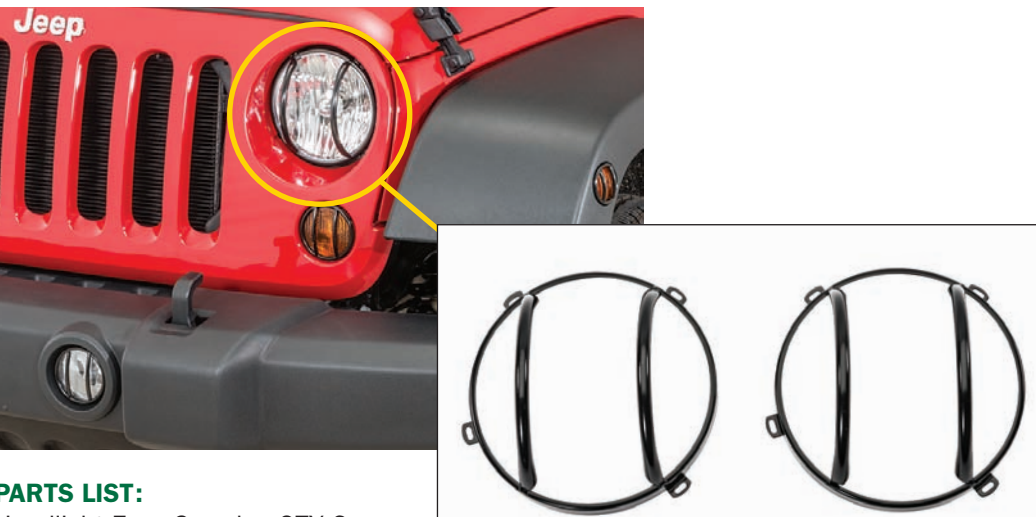
PARTS LIST: Headlight Euro Guards - QTY 2

Installation Manual: for '07-Current Jeep Wrangler JK #13117.0110 and #13117.0200