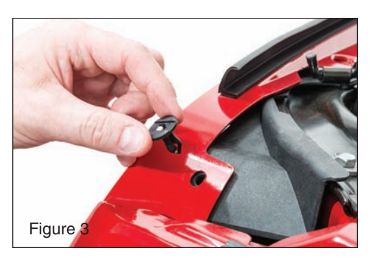
Depending on your model year, pry up or unscrew the plastic fasteners (6 total) using a small screw driver. Early vehicles may feature phillips head screws, but most vehicles have a pry-up rivet as shown (Fig 2). First remove the center, then remove the body of each plastic retainer (Fig 3). Set rivets & screws aside in a safe place for re-installing the grille.

Next, gently tilt the front Grille forward so you can reach the headlight assembly (Fig 4).