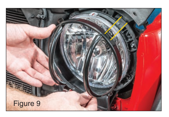
Repeat this sequence for the other side. With the Torx head screws you removed in step 3, partially reinstall each screw into the 3 alignment tabs (Fig 10). Do not tighten yet. Starting from left to right, tighten each screw an even amount to "pull" the Euro-Guard tight onto the headlight (Fig 12). Repeat for the other headlight.

NOTE: The Euro-Guard is designed to fit very tight. This is why we suggest the above method of installation.