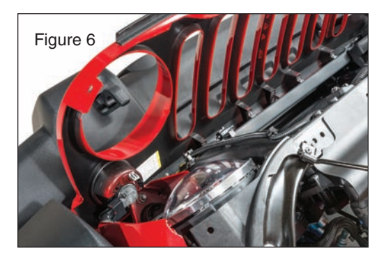
gently pop the grille from its lower retainer clips. Once the grille is removed and/or tilted forward, locate the chrome trim rings around the Headlights. Using a T15 Torx screw driver, remove the factory headlight trim ring on each headlight (Fig 8). Place the removed screws (4 per light) in a safe place as they will