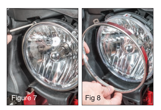
be re-used to install the Headlight Euro-Guard. With the chrome trim ring removed, place the front Euro-Guard trim ring (each will fit either side) over the headlamp lining up the tabs as shown below (Fig 9). When installed, the Euro-Guard bars will be vertical and each tab will align in a slot on headlight housing.