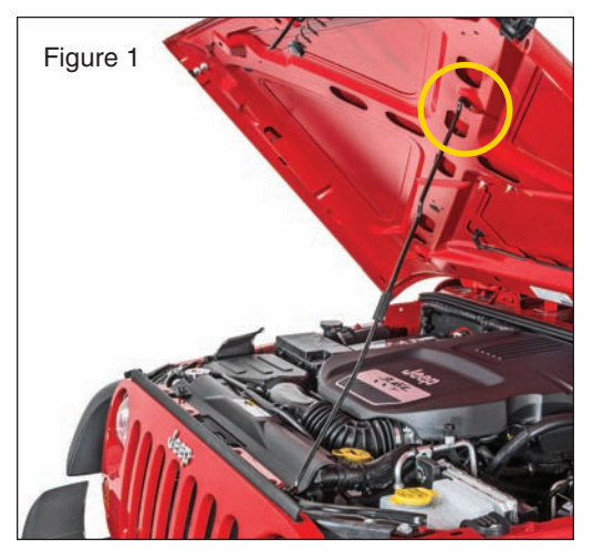
Put on safety glasses. Open the hood of your Jeep<sup>®</sup>. Put the prop rod into the correct slot to hold hood open (Fig 1).