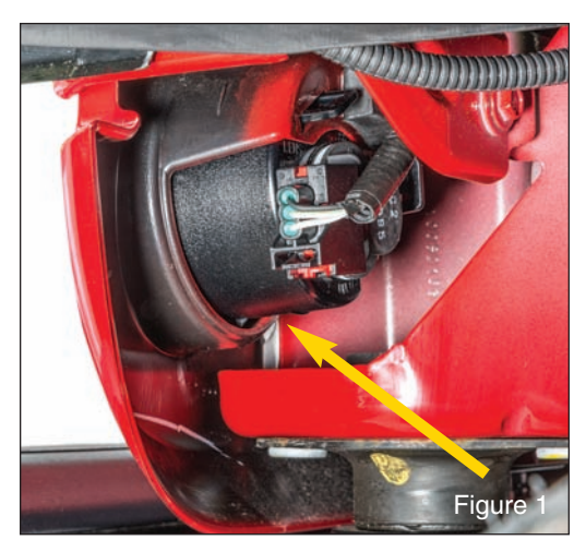
Put on safety goggles or glasses. Locate the back of the turn signal housing by looking under your front drivers fender, behind your bumper (Fig 1).