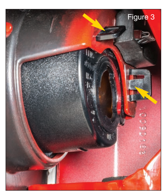
With the bulb and socket removed, locate the two housing retaining tabs (Fig 3) and gently pry with a small flatblade screwdriver outwards to release