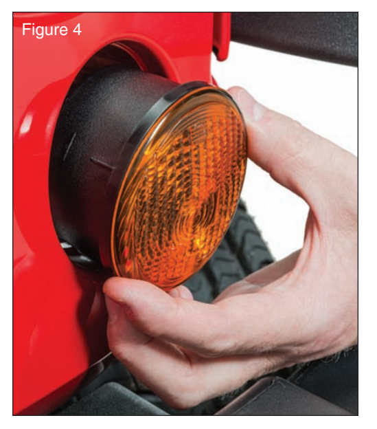
the housing from the grille assembly (Fig 4). The turn signal housing can now be easily removed by pushing it through the grille.