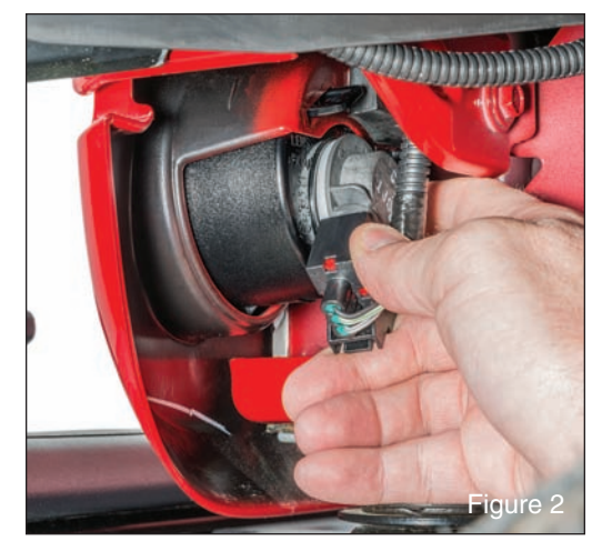
Remove the bulb and socket assembly from the housing by twisting the socket down towards the ground one quarter of a turn until it loosens (Fig 2).