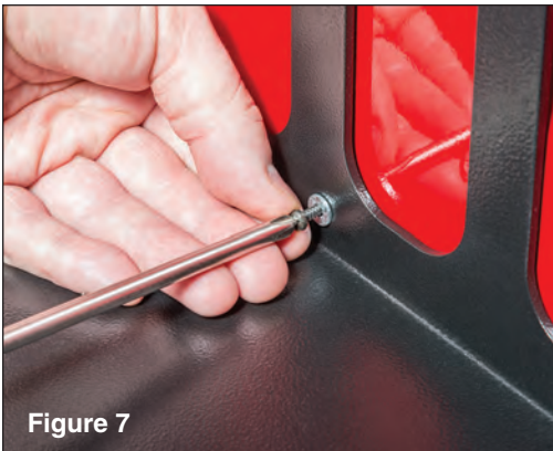
Figure 7 Thread the screws into the inserts using either a long or a stubby #2 Philips screwdriver. Snug the screws but do not over tighten. See figures 6 & 7.