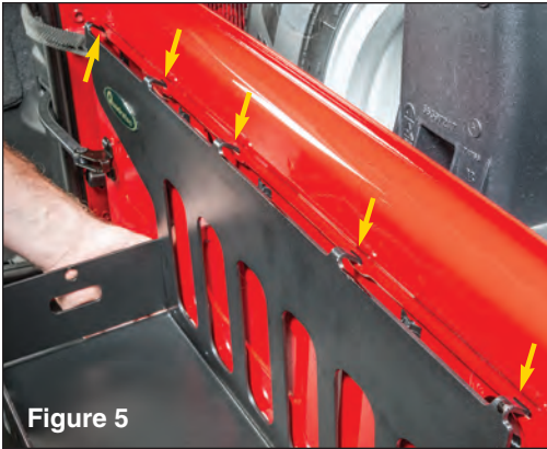
Figure 5 Tilt the cargo shelf and then install the hooks into the slots of the tailgate and gently drop the shelf down and into position. (FIG 5)