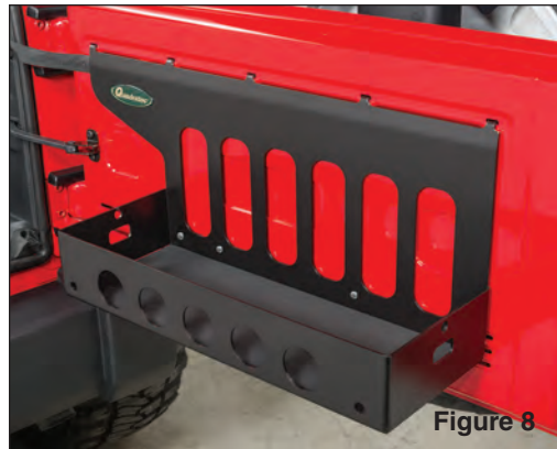
Figure 8 Install the provided rubber pad in the base of the Cargo shelf (FIG 8) to help prevent vibration of cargo.

The provided straps should also be used to help secure larger items in your Cargo shelf.