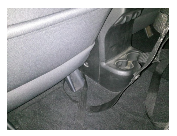
On the 4 dr unlimited wrap the strap around the inside seat bracket first and then to the outside foot and back upto the net

The long straps at the bottom pull down and wrap underneath the front seat seat brackets as shown. The JK and JKU have different style seat brackets. As seen in the two photos. The straps come back up and connect into the lower Cam buckle.