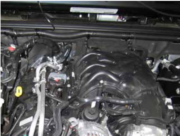
a. Remove the engine cover.