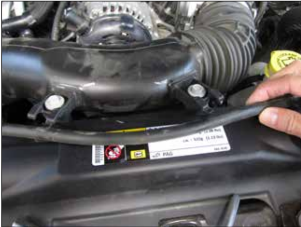
e. Release the coolant bypass hose from the finger clamps on the stock intake tube.