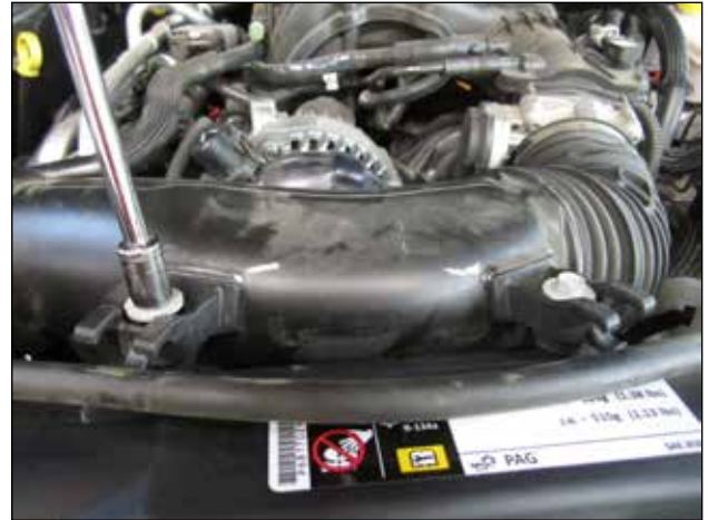
f. Remove the two M6 bolts retaining the intake tube to the radiator upper cross member.