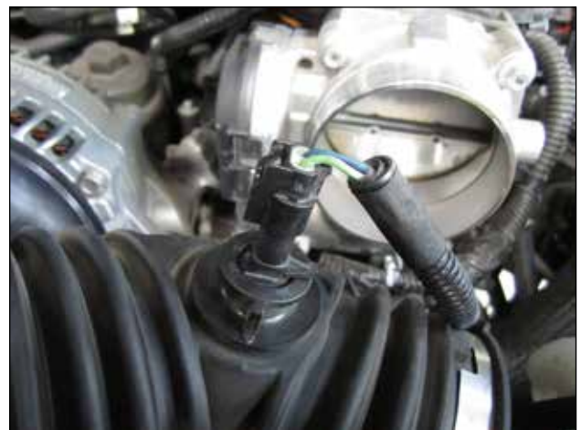
h. Disconnect the IAT sensor harness by pushing the tab and pulling on the connector.