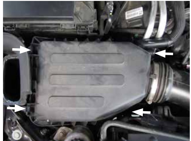
b. Release the 4 clamps on the stock airbox lid.