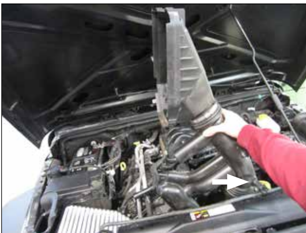
g. Pull up on the stock intake tube and lid assembly until the IAT sensor is visible and accessible.