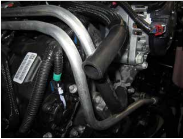
c. Disconnect the rubber breather hose from the stock air box lid.