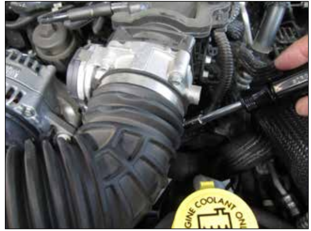
d. Loosen the hose clamp on the stock intake tube at the throttle body.