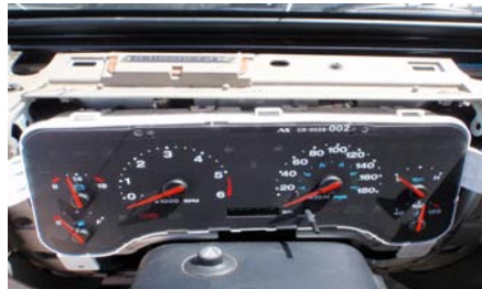
6. Remove the clear Lens. Turn Key forward.