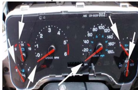
9. Mark each needle setting on the diagram