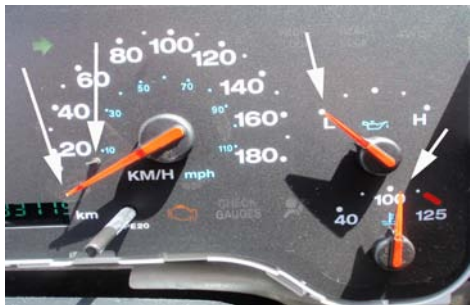
8. Lift the tip of the speed needle around the needle stop.