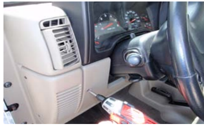
1. Remove the Screws from the knee trim.