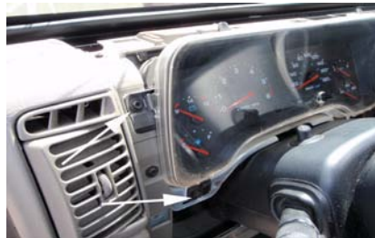
5. Remove the 4 screws on the speedometer.