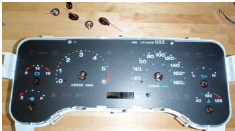
12. Use the needle tool to remove the needles AND black gauge face.