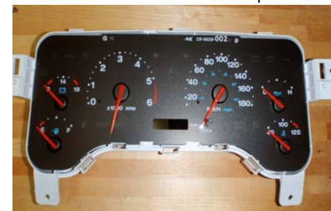
11. Take speedo into a clean area to remove the stock black gauge face.