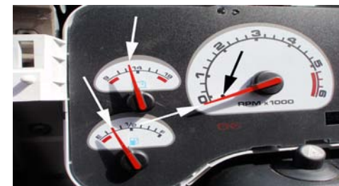
15. Set the needle exactly where you marked them at.