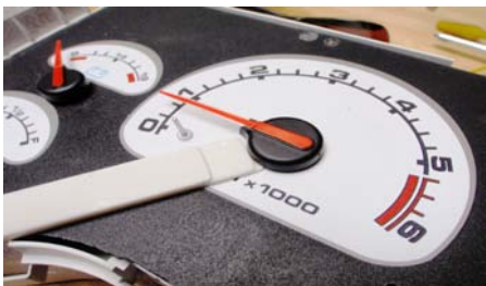
16. After you have the needles in place, Use the handle of the needle tool as a gap tool under the hub of each needle.