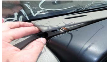
2. Remove the trip on the top of the dash.