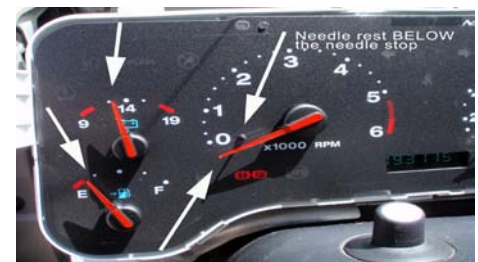
7. Lift the tip of the tach needle and move under the needle stop.