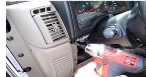
3. Remove the 4 screws from the speedo trim.