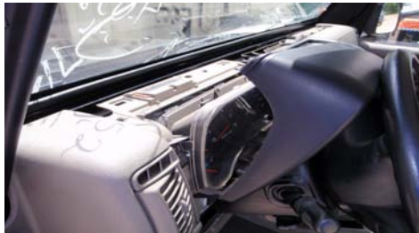
4. Remove the trim around the speedo.