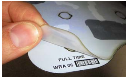
13. Remove the plastic liner from the back side and place on the speedo.