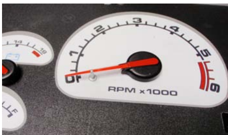
17. Place the needle stop into position and reinstall speedo.