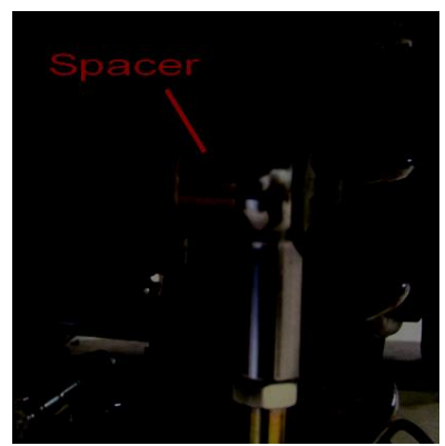
Top Sway Bar Connection