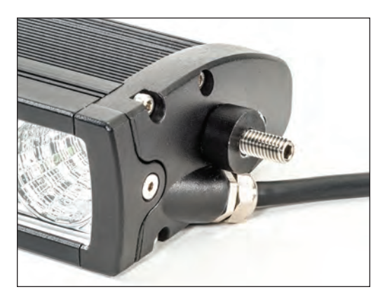
Install the studs (supplied with light bar) into the ends of the light bar. Snug with a 4mm hex and install the supplied