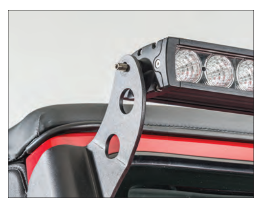
spacer on both ends. Carefully insert the stud through the hole in the bracket on the passenger side.