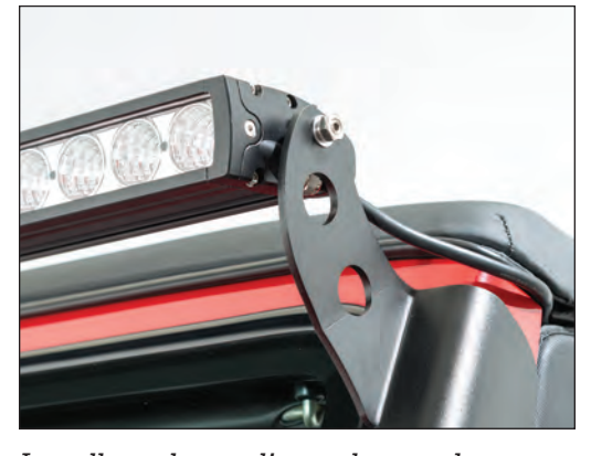
Install washer, split washer, and nut (supplied with lightbar) on both sides. Adjust lightbar to the desired angle, then and tighten the nuts with a 13mm wrench.