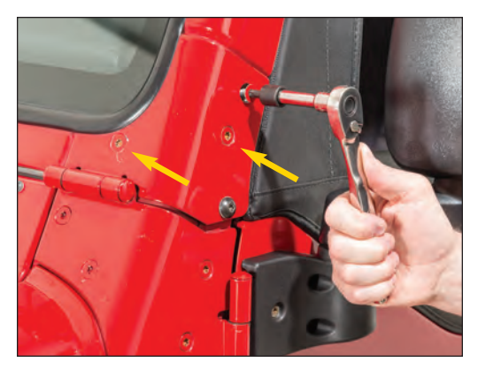
Put on Safety Glasses. Locate and remove the 3 T40 torx bolts from the upper windshield hinge.