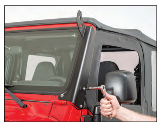
Place the driver side bracket against the A pillar and attach using 3 supplied hex head cap screws and washers.