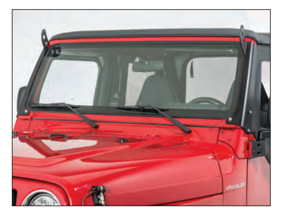
Using a 3/16 hex wrench snug but do not fully tighten the screws as this point. Repeat for passenger side.