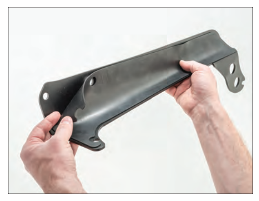
Locate Driver and Passenger side brackets and place the corresponding gaskets on the backside of each bracket.