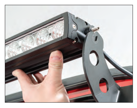
Drop the stud on the driver's side down into the slot.