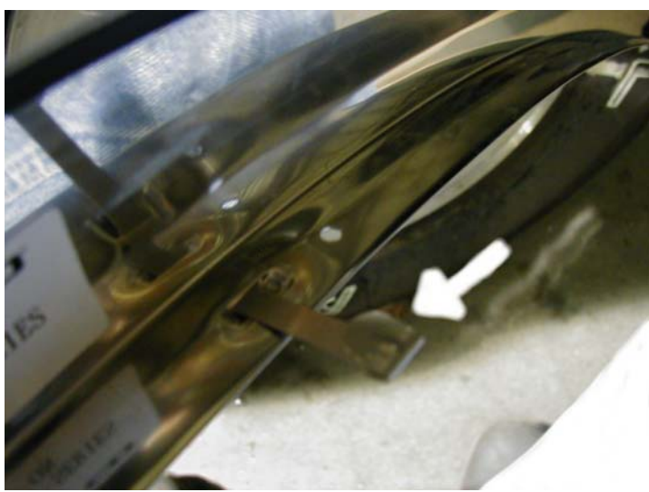
Arrow points to bent end (band should bent up)