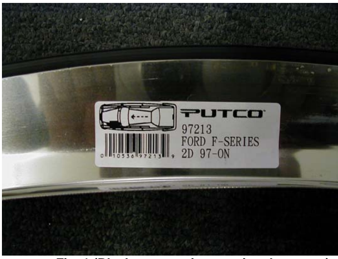
Fig. 1 (Black arrow points to trim placement)

Contact your PUTCO dealer for other quality accessories. PUTCO Inc. - 216 West First Street - Story City, Iowa 50248 Please read all instructions before installation and check to see that all parts are included. NOTE: THE PICTURES IN THIS INSTRUCTION ARE FOR ILLUSTRATION PURPOSES ONLY.