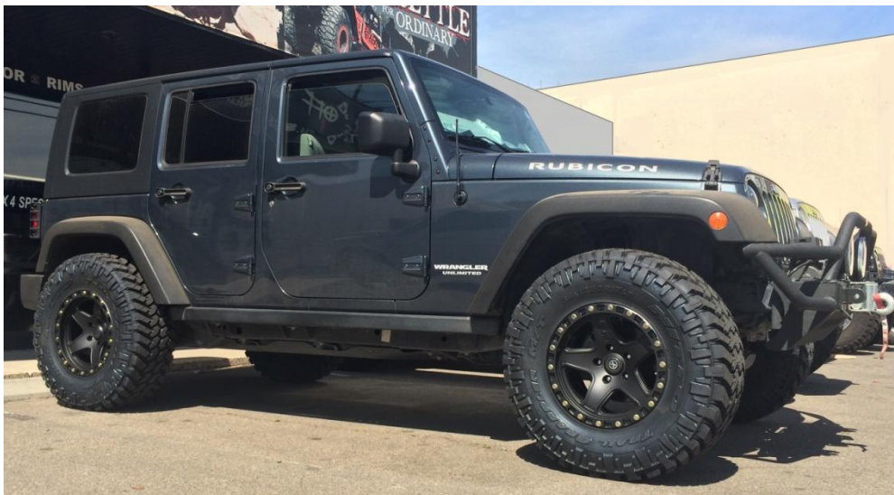
EVO MFG 1.5" HD Leveling Kit shown w/ 35" Tires, aftermarket front bumper and winch.