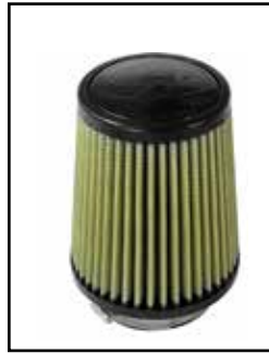
Pro GUARD 7 Air Filter