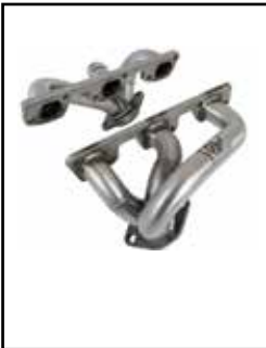
Twisted Steel Header