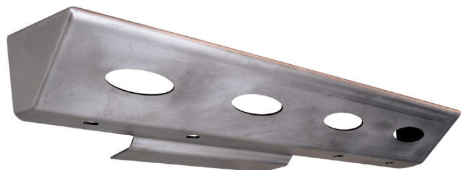
17-59-030 JK Brawler Lite Front Skid Plate

These installation instructions apply to the following Poison Spyder products: