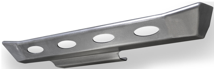
17-63-030 JK Brawler MID Front Skid Plate

These installation instructions apply to the following Poison Spyder products: