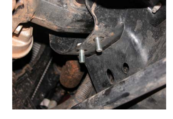
Step 3: Install the passenger side-mounting bracket using the bolts just inserted into the motor mount. The mounting tab faces the rear of the vehicle. It is shown with the strut rod attached in the photo to the left. Leave these bolts loose for now.