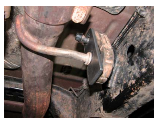
Step 17: Place the Exhaust Hanger Adjuster over the exhaust hanger pins as shown in the photo to the left. This "locks" the two pins together to facilitate bending the frame mounted pin upward in the next step.

Step 16: Loosen one of the bolts that holds the exhaust Y pipe to the exhaust manifold on the passenger side. We have found that the front-most bolt is most easily accessed from the inner fender area. Again, there is no need to loosen both bolts.