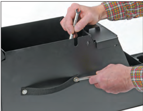
FIGURE 1. Using (4) #10-32x1/2" Bolts, (4) 3/16" Washers, and (4) #10-32 Acorn Nuts, attach both driver and passenger seat belt support straps. Make sure to place the washer on the outside of the strap.

NOTE: This console has been designed to be used in a stock Jeep application. Some fitment issues may arise if installed in a vehicle that has been modified with a body lift, different transmission and/or transfer case and aftermarket seats. It is the owner's responsibility to address these fitment issues. If vehicle is equipped with a body, lift the transmission and transfer case shift levers may need to be bent to allow for proper fitment of console.