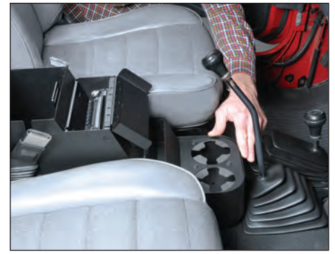
FIGURE 6. Center the console between the front seats and position the console front and back to a position that ensures there is no interference with the transmission and transfer case shift levers. Some fold and tumble rear seats may make contact to the back of console when tumbled forward but it is imperative that your shifter levers and shifter boots operate without contacting the front of the console.