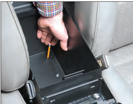
FIGURE 7. Mark the carpet and floor with a sharp pencil to determine bolt hole placement. Hint: Place strips of masking tape on top of the targeted carpet area to help with your markings. Pierce the tape with a sharp pencil to transfer the mark to the metal floor.