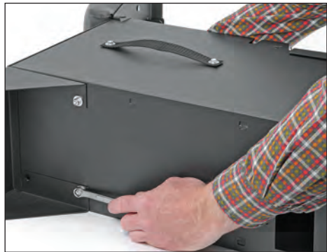
FIGURE 2. Attach the rear riser bracket by inserting two (2) 10-32x1/2" bolts through the 1/4" holes on the bottom of the console. Fasten with (2) 3/16" washers followed by (2) #10-32 locknuts. Make sure the bracket is square and flush with the console before tightening.