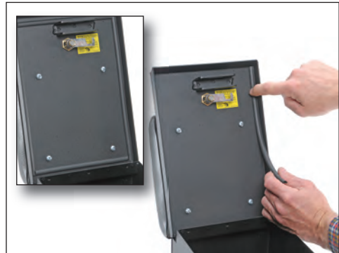
FIGURE 3. Cut to length the rubber seal and apply at the edge of the lid's interior and check the lock operation.