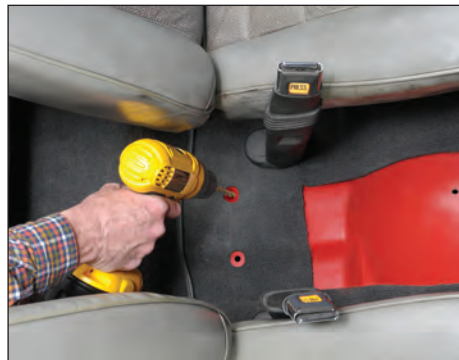
FIGURE 8. Remove the console and cut small 1" diameter holes in the carpet at your pencil marks. Drill 3/8" bolt holes at each of the three markings. Make sure to observe that nothing under the vehicle can be damaged by the passing drill bit. Use touch up paint or silicone sealant around the drilled holes if desired.