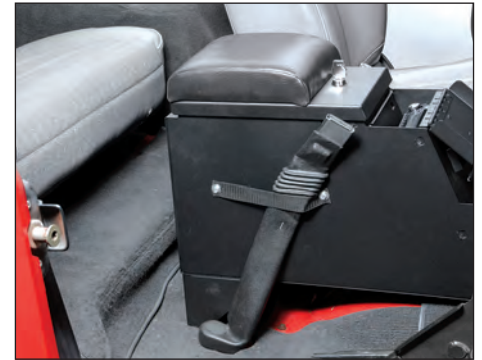
FIGURE 9. Note: A second person is necessary to assist with the final installation. Place your console back into position while running the seat belt buckle sleeves through the console's side seat belt straps as shown. Here's where assistance is helpful. Fasten the rear of the console to the floor using (2) 5/16" x 5-1/2" bolts with 5/16" washers on each. Place a washer and 5/16" locknut to each bolt and tighten. Fasten the front of the console through using the shorter 5/16" x 1-3/4" bolt with washer followed by a 5/16" washer and locknut and tighten. Install rubber floor mat to the console's interior. Console installation is now complete.