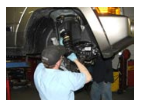
Revised 10 May 06

Attach the lower end of the strut and use the floor jack to raise the control arm and strut up into place, then install the 4 upper nuts. Reinstall the control arm lining them up the cam bolts as near as possible to the original location.