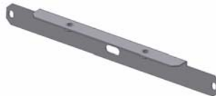
#4 Mounting Bracket