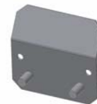
#3 Door Stop