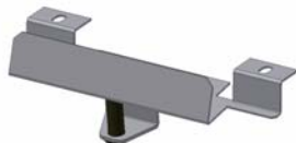
#6 Latch Bracket