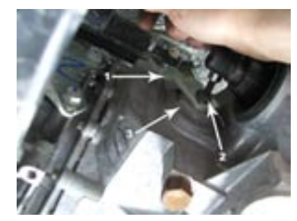
2. Remove the shift lever (#1) from the shift Sector (#3).

1. Use the T40 Torx bit to remove the bolt (#2) that holds the Shift Lever (#1) to the sector shaft (#3).