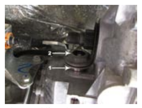
Disassembling the Case

holds the seal and the bearing for the shift sector shaft (#1).