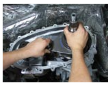
NOTE: Verify that the long side of the mode sleeve is towards the front of the transfer case.