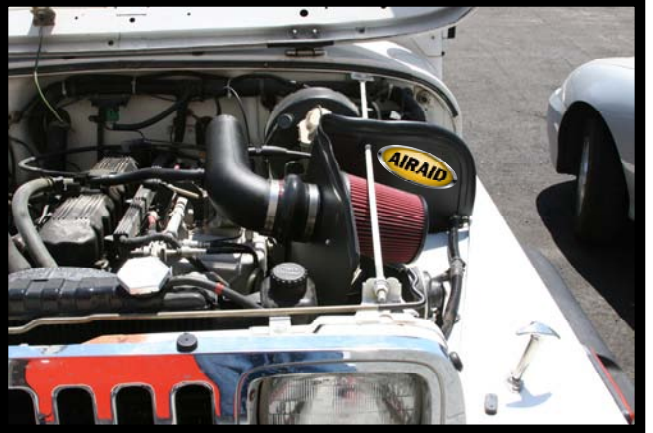
19. Apply the Airaid Foil Decal onto the Panel as shown. towards the back of the vehicle.

Double check your work, make sure all nuts, bolts, and clamps are securely fastened. Make sure there is no foreign material in the intake path. Re-connect the negative battery cable.