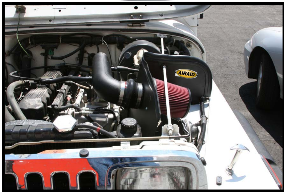
Does Not Fit Vehicles With Optional Anti-Lock Brakes