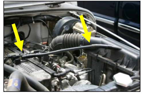
1. Disconnect negative battery cable. Remove factory valve cover breather hose from airbox, and valve cover.

Full color instructions can be viewed on our web site at Airaid.com . If you need <u>any</u> assistance please call 1-800-858-3333 to speak with a representative in our Customer Service Center before returning the product.