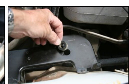
4. Remove the two grommets from the airbox mounting plate.