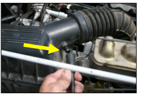
2. Unhook vacuum line from airbox, and remove from vehicle at the canister below the master cylinder. (Save for later use.)