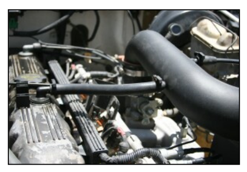
17. Replace the factory breather hose with \frac{1}{2} "x10" rubber hose between valve cover and intake tube using speed clamps as shown.