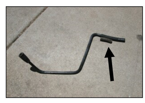
13. Remove the factory hose from step 2, and install the new 3/8"x 4" hose on the end of the vacuum line as shown. Reinstall vacuum line. (Refer to step 2.)