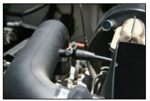
16. Slide intake tube into the hump hose first, and then into the coupler. Adjust for a good fit, and tighten hose clamps. Slide vacuum hose on barbed fitting, and install speed clamp as shown.