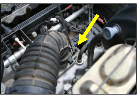
3. Pry open the plastic clamp that holds the factory intake tube to the throttle body. Unhook the 3 metal latches on the airbox that hold it to the mounting plate, and remove the intake assembly.