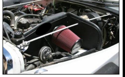
18. Install the Airaid Premium Filter and the weather strip on the CAD, as shown. (Hint: start the weather strip near the radiator support and work towards the back of the vehicle.)