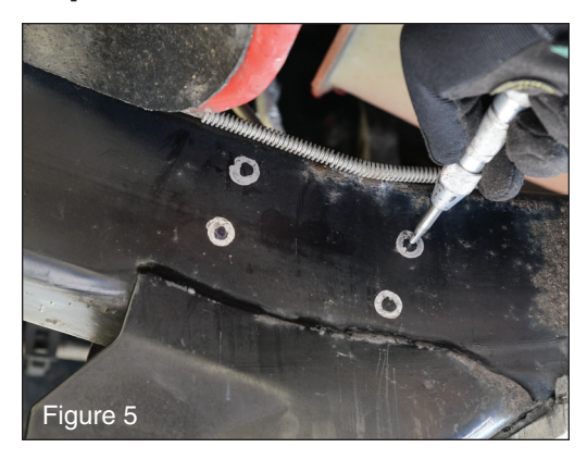
First, put your safety glasses on. Then using a center punch, mark the center of each of the holes. (Figure 5)