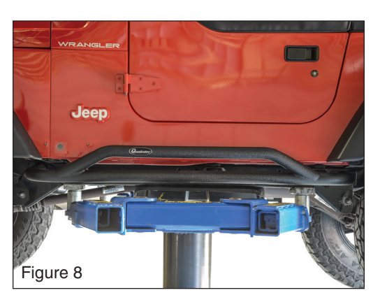
Repeat the steps on the opposite side. Installation is complete.