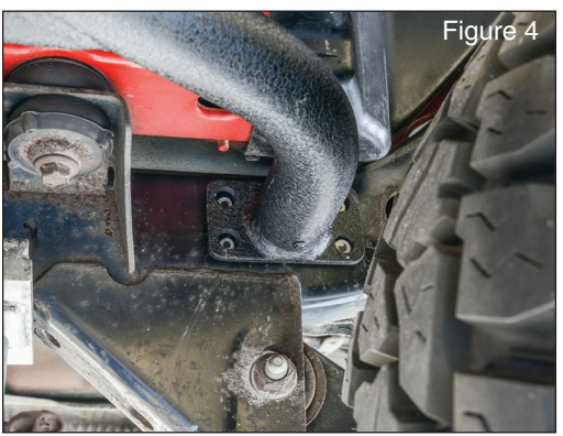
Once the guards have been positioned properly you will need to trace the mounting holes of the front and rear brackets against the frame with a paint pen or marker as shown. (Figure 4)