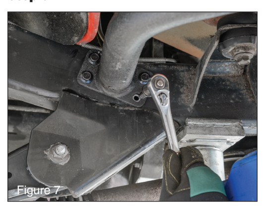
Reposition the rocker guard over top of the holes in the frame and install the (8) 3/8 x 1" self tapping screws with a 13mm socket and ratchet. (Figure 7)