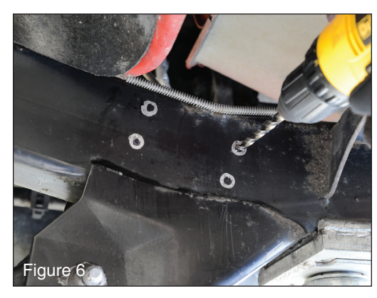
Drill holes in the frame with a drill and 5/16 drill bit. You may want to drill a pilot hole with a smaller bit first. (Figure 6)