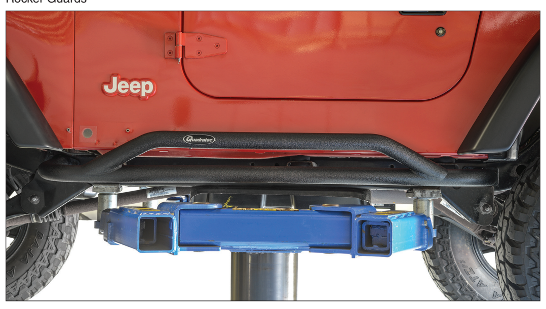
Side Armor with Step