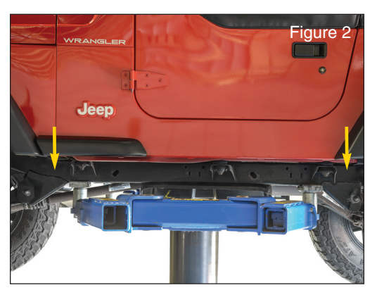
Locate the areas of the frame that are in front of the front body mount and behind the rear body mount as shown. (Figure 2)