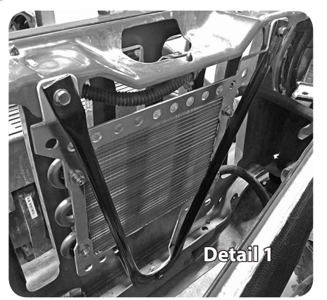
TJ mounted with support brace