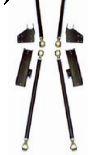
NOTE: This kit is designed for a MINIMUM of 3 inches of lift.

This kit is designed specifically for use with TeraFlex lifts and suspensions. It replaces standard-length control arms with new, longer lower control arms. The upgrade will improve on-road driving comfort as well as off-road performance.