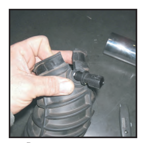
Remove temp sensor