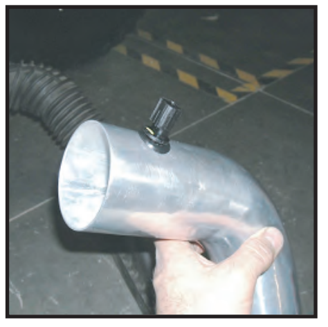
Install sensor into new tube

5. Install rubber isolator mount to heat shield. Insert tube into throttle body coupling and secure with large 2.5" hose clamp. Connect wire lead back to tempreture sensor. Line heat shield filter opening with rubber trim.