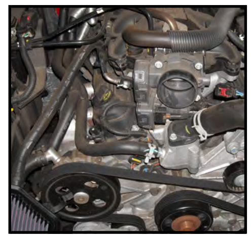
Remove breather tube