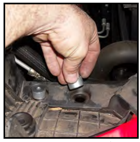
Place spacers on top of tray