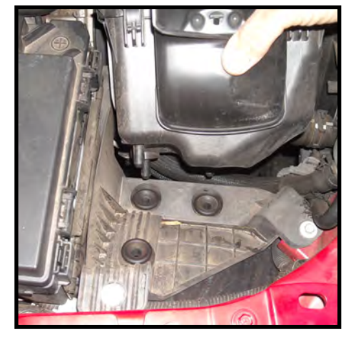
Pull air box free from inner fender

2. Remove mounting bushings from tray. Place aluminum spacers onto try. Remove top passenger side radiator shroud bolt.