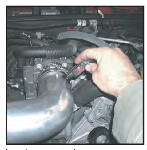
Lead connected to temp sensor