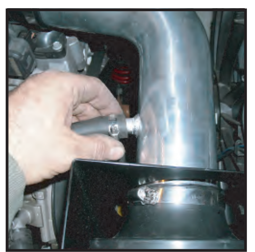
Connect breather hose with clamp