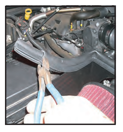
Install weather stripping

9. Congratulations on the purchase and installation of another quality Rugged Ridge product.