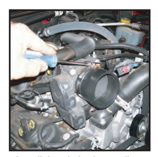
Install throttle body coupling

4. Carefully remove temperature sensor from original intake pipe. Take care not to break the plastic sensor. sensor may need to be cut out of stock rubber intake tube. Insert rubber grommet into new tube and then install temperature sensor into grommet as shown.