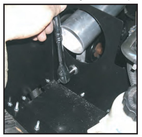
Secure tube to heat shield

Note: This filter is polyester synthetic and never needs to be oiled. It can de cleaned with warm water and mild detergent dish soap.