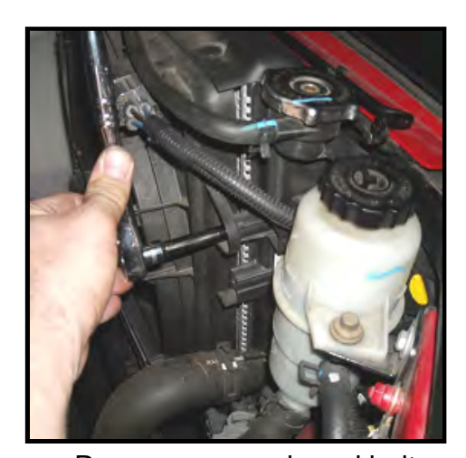
Remove upper shroud bolt