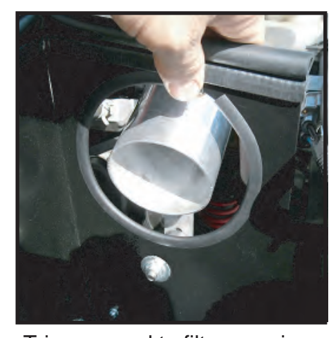
Trim secured to filter opening