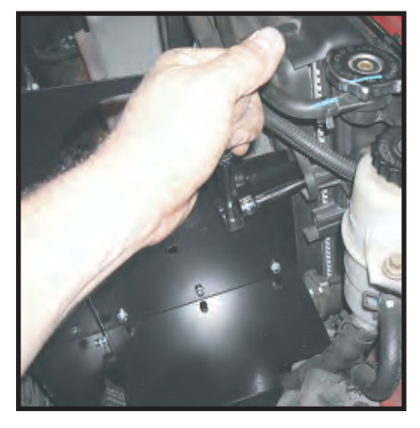
Tighten all heat shield bolts

4. Carefully remove temperature sensor from original intake pipe. Take care not to break the plastic sensor. sensor may need to be cut out of stock rubber intake tube. Insert rubber grommet into new tube and then install temperature sensor into grommet as shown.