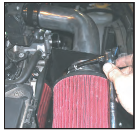
Install filter to intake tube