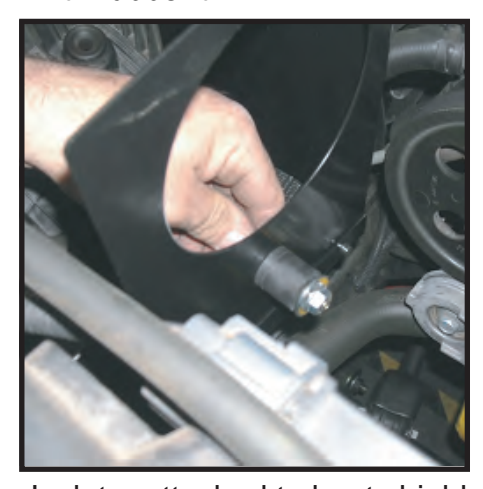
Isolator attached to heat shield

5. Install rubber isolator mount to heat shield. Insert tube into throttle body coupling and secure with large 2.5" hose clamp. Connect wire lead back to tempreture sensor. Line heat shield filter opening with rubber trim.