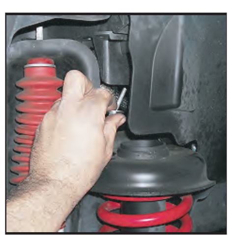
Install bolts from below