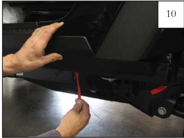
From rear to front, pull tape liner tab 5. Press firmly on the part following tape liner removal. NOTE: Refer to step 1 for additional tape tab identification.