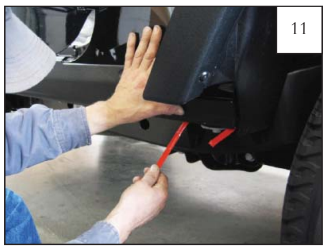
From rear to front, pull tape liner tab 6. Press firmly on the part following tape liner removal. NOTE: Refer to step 1 for additional tape tab identification.