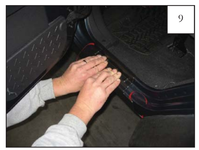
Repeat steps 6, 7, & 8 at rear door sill for tape tabs 3 & 4 (tab 1 equivalent to tab 3, tab 2 equivalent to tab 4).