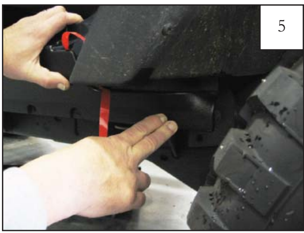
Place part on vehicle, making sure to line up edges of part with edges of vehicle and hole in part with clips installed in step 4. Ensure that all tape tabs are accessible.