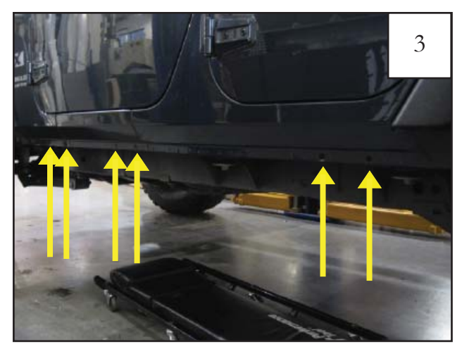
Locate the six factory holes in the rocker.