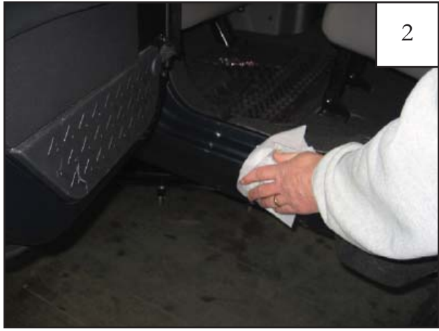
Open vehicle door. Clean all dirt and debris from vehicle door sills, rocker panel, and beneath flares if installed. Then use supplied alcohol wipe where part will be. NOTE: Temperature should be at least 60°F for proper tape adhesion.