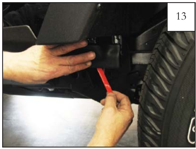
From rear to front, pull tape liner tab 8. Press firmly on the part following tape liner removal. NOTE: Refer to step 1 for additional tape tab identification.