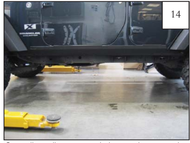
Once all tape liners are peeled, press down on entire length of part again, applying 30 PSI to the taped areas. NOTE: The tape reaches maximum adhesive bond after 24 hours of contact. Do not wash vehicle for 24 hours.