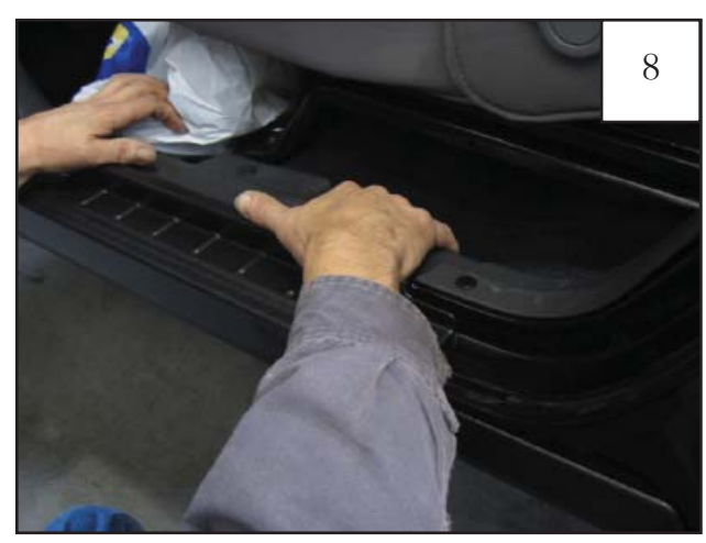
Press down firmly on part along the length of the sill.