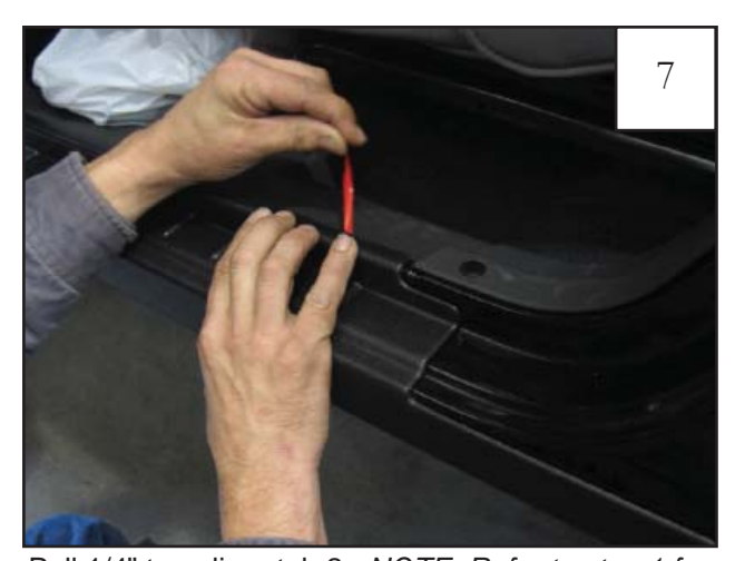
Pull 1/4" tape liner tab 2. NOTE: Refer to step 1 for additional tape tab identification.