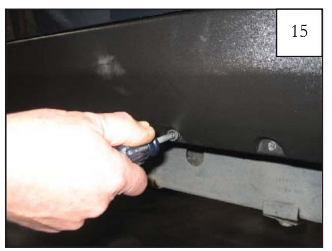
Using a #2 Phillips screwdriver, start a screw through each hole in side panel and through clips installed in step 4. Once all screws are started, tighten.