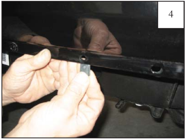
Place a clip over each hole with threaded portion of clip on the inside.