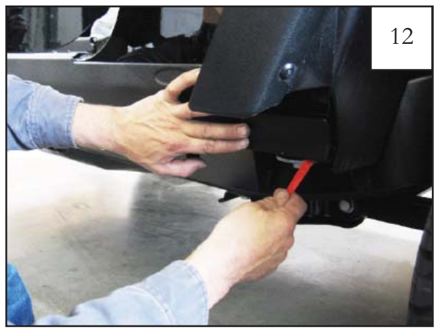
From rear to front, pull tape liner tab 7. Press firmly on the part following tape liner removal. NOTE: Refer to step 1 for additional tape tab identification.