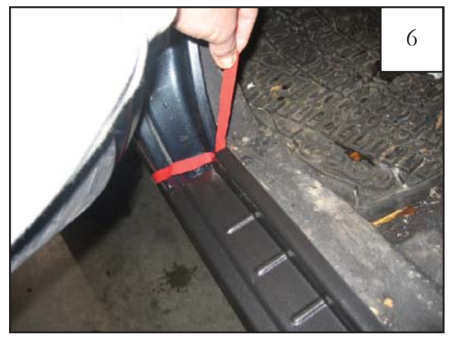
At the front door sill, pull 1/2" tape liner tab 1. NOTE: Take care not to catch tape liner of other pieces of tape and accidentally pull their liners off as well. NOTE: Refer to step 1 for additional tape tab identification.