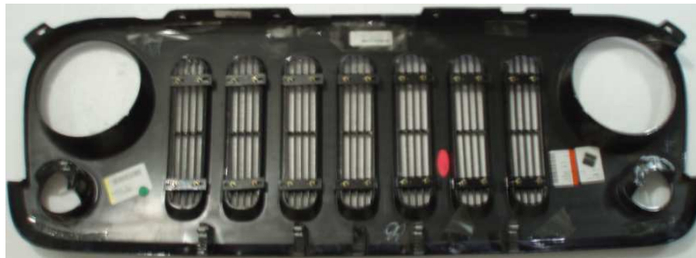
Figure 3 – Rear view of vehicle's shell; Billet Grills attached with Metal Brackets and Flange Nuts