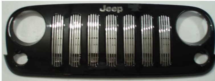
Figure 2 – Front View of positioning lower Billet Grille