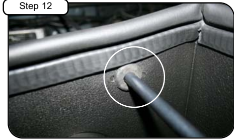
Allign grommet from step 8 and position in hole to prevent core support bracket from vibration.