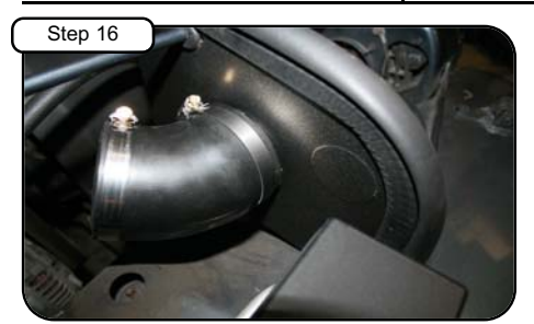
Attach elbow coupling with #048 clamps to housing and position. Do not tighten.

Note: Filter Cleaning and Re-oiling: When cleaning your aFe filter, be sure to use only aFe's "Restore Kit" (aFe P/N: 90-50001 blue oil aerosol, aFe P/N: 90-50501 blue squeeze bottle oil, aFe P/N: 90-59999 Pro Dry 5 ™ cleaner only.) Pro Dry 5 ™ cleaning: see cleaning instruction sheet 06-00074. For replacement part(s) or "Restore Kit" please call aFe sales/tech support @ 951-493-7100