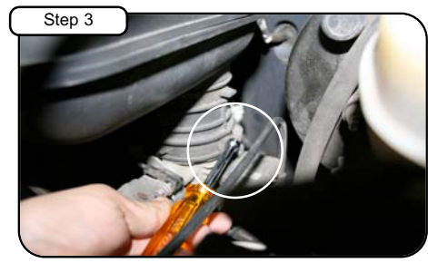
Loosen clamp on throttle body using 5/16" nut driver.