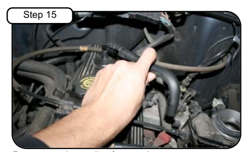
Remove crank case line from engine