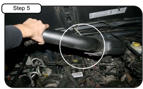
Pull crank case line away from stock intake and remove from vehicle.