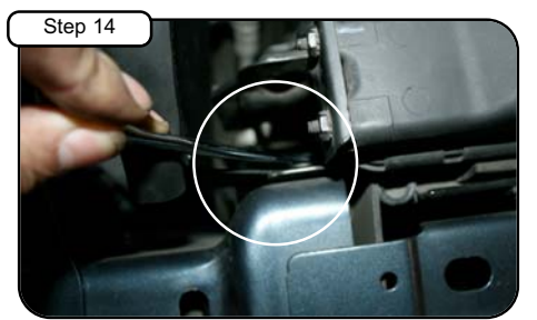
Secure bracket on housing using screw from step 9 using 10mm wrench.