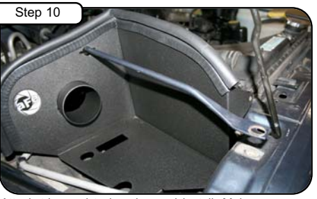
Attach trim seal to housing and install. Make sure core support bracket slides through hole on housing.