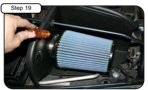
Install air filter and tighten all clamps using 5/16" nut driver. Reconnect battery terminals.