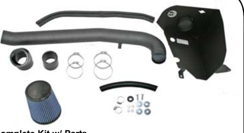
Complete Kit w/ Parts