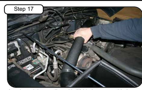
Attach straight coupling with #044 clamps provided on end of intake tube and position to housing and throttle body.