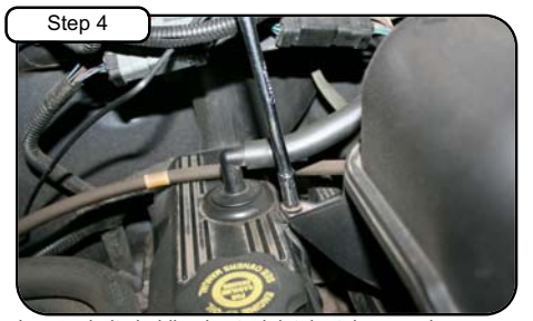
Loosen bolts holding in stock intake tube on valve cover using 8mm socket or wrench and remove.