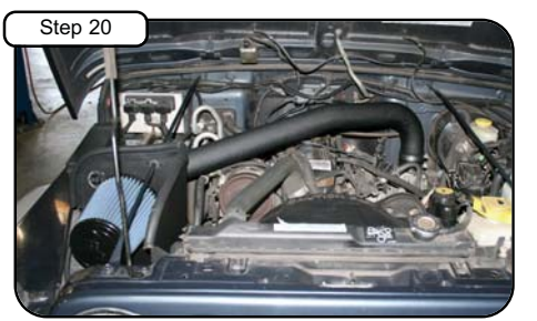
Your installation is now complete. Make sure to check all hoses and tighten any clamps or hardware if necessary. Thank you for choosing aFepower.