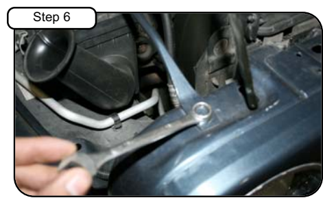
Loosen bolt on core support bracket using 13mm socket or wrench.