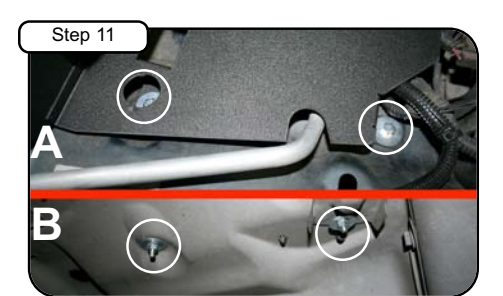
A)Top view: Secure housing using hex screws, fender washers , wavy washers and nuts. B)Bottom view: Tighten using 10mm socket or wrench.