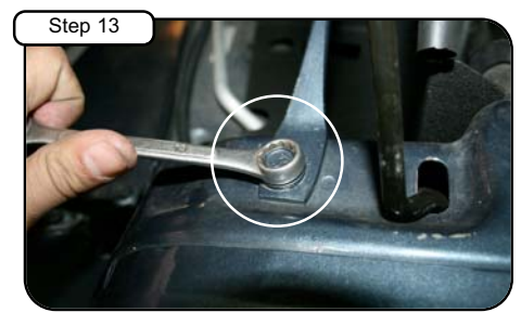
Secure core support bracket using 13mm.