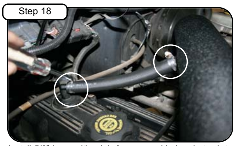
Install 5/8" hose with mini clamps provided and attach to engine and intake tube. Secure mini clamps using 1/4" nut driver.