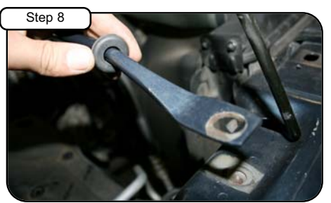
Attach grommet provided and install on core support