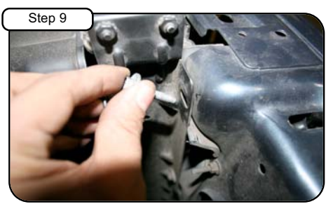
Loosen bolt on core support using 10mm wrench. Save