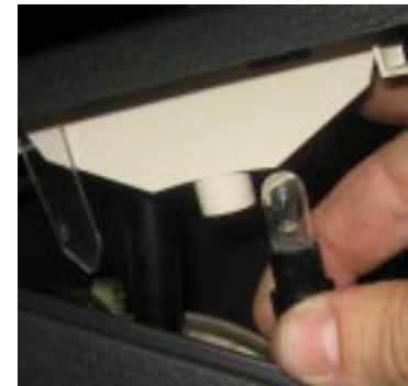
Figure 10: Indicator Light

5. Move transfer case handle to 4wd-Low and then pull the console out.