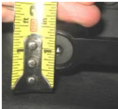
Figure 21: 1" from console