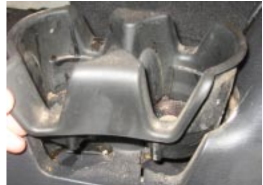
Figure 8: Cup Holder Removal