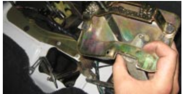
Figure 13: Remove Shifter Linkage