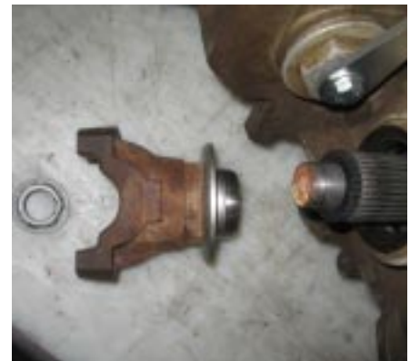
Figure 31: Proper Yoke Installation Order

SPECIAL NOTE: The components packaged in this kit have been assembled and machined for specific type of conversions. Modifications to any of the components will void any possible warranty or return privileges. If you do not fully understand modifications or changes that will be required to complete your conversion, we strongly recommend that you contact our sales department for more information. This instruction sheet is only to be used for the assembly of Advance Adapter components. We recommend that a service manual pertaining to your vehicle be obtained for specific torque values, wiring diagrams and other related equipment. These manuals are normally available at automotive dealerships and parts stores.