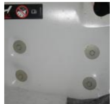
Figure 12: Shifter Pivot Assembly Bolts