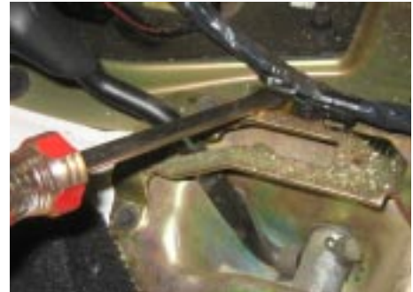
Figure 11: Remove Wire Loom Connector Clip