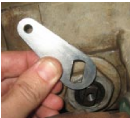
Figure 30: New Transfer Case Shift Lever Orientation