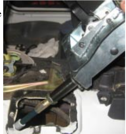
Shifter Box Assembly