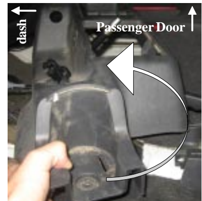
Figure 17: Console Install

SPECIAL NOTE: The components packaged in this kit have been assembled and machined for specific type of conversions. Modifications to any of the components will void any possible warranty or return privileges. If you do not fully understand modifications or changes that will be required to complete your conversion, we strongly recommend that you contact our sales department for more information. This instruction sheet is only to be used for the assembly of Advance Adapter components. We recommend that a service manual pertaining to your vehicle be obtained for specific torque values, wiring diagrams and other related equipment. These manuals are normally available at automotive dealerships and parts stores.