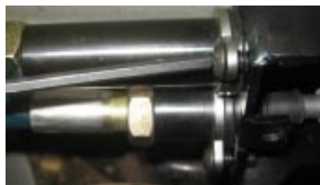
Figure 22: Tighten Retaining Clip