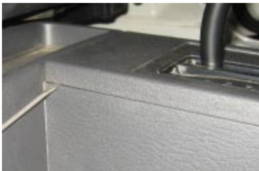
Figure 9: Transmission Shift Indicator

4. Use a 10mm socket to remove the two console bolts located under the cup holder and under the shift indicator panel.