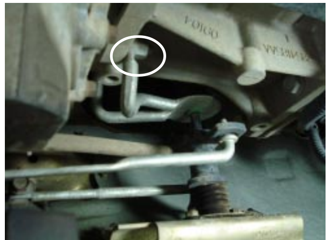
Figure 13A & B

SPECIAL NOTE: The components packaged in this kit have been assembled and machined for specific type of conversions. Modifications to any of the components will void any possible warranty or return privileges. If you do not fully understand modifications or changes that will be required to complete your conversion, we strongly recommend that you contact our sales department for more information. This instruction sheet is only to be used for the assembly of Advance Adapter components. We recommend that a service manual pertaining to your vehicle be obtained for specific torque values, wiring diagrams and other related equipment. These manuals are normally available at automotive dealerships and parts stores.