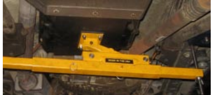
Figure 1: Uni-Raise