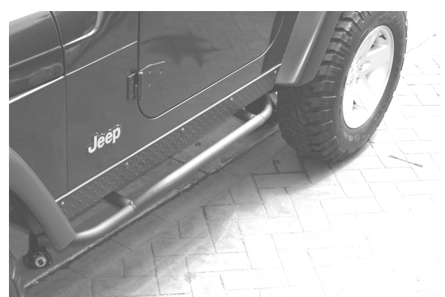
171- Reversa Bars installed on a TJ Wrangler Rubicon