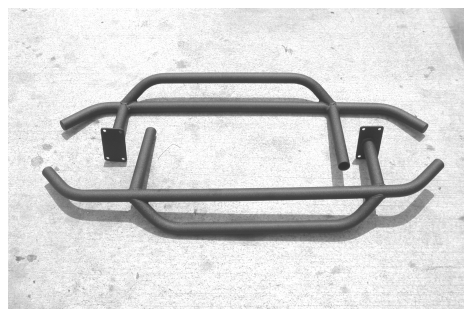
Reversa nerf bars