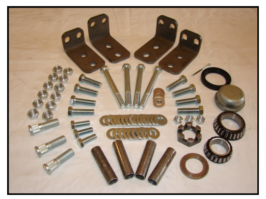
PAGE 1 of 4

M.0.R.E™, BombProof™, S.R.S.™, SlipLoc™, DoubleJointed™, RockProof™, are trademarks used by Mountain Off Road Enterprises, LLC. copyright⊚, 1999-2008.