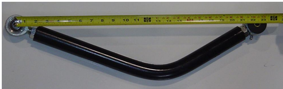
Triangulated 4 -Link Assembly

14. For TJ and LJ X Factor Plus Only (All other systems skip this step); Set the triangulated upper arms to length as shown below. Set the arms to length specified above. The dimension is from center of Krawler joint to center of Flex Joint. Note: That the Flex Joint is rotated 90 degrees from its correct position, for setting the proper length. Do not allow more than 1/2" of threads to show past the jam nut. Be sure to orient the joint to allow for the maximum deflection and tighten the jam nut! It is important to make sure the jam nut is tight to apply preload to the threads in the arm. The use of red loctite is recommended to stop the jam nut from backing off.