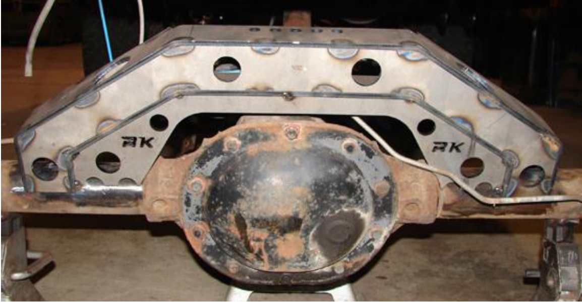
Cradle Tie in Plate Installed

c) Install the rear upper reinforcing mounts as shown and weld them into place on the bottom of the frame. (Passenger side shown) The new bracket goes in between the OEM bracket and where the new joint goes.