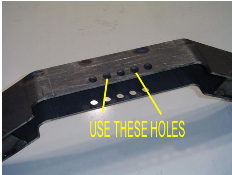
Weld in cradle specified holes

16. TJ and LJ X Factor Only (All other systems skip this step); You can remove the steel mounting brackets for rear parking brake cables and zip tie the brake lines to the rear upper control arms using the supplied zip ties.