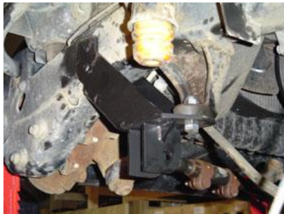
TJ/LJ Front Track Bar Bracket

For TJ and LJ perform the following; Bolt the bracket to the stock cast iron bracket with the supplied \frac{1}{2} " x 1.75" long bolt and nylok nut and tighten it to draw the bracket up tight. Once the bracket is tight, drill through the frame by center punching the holes and drilling through the frame with a \frac{1}{2} " drill bit and mount the bracket with the (2) supplied \frac{1}{2} " x 4.0" long bolts and nylok nuts.