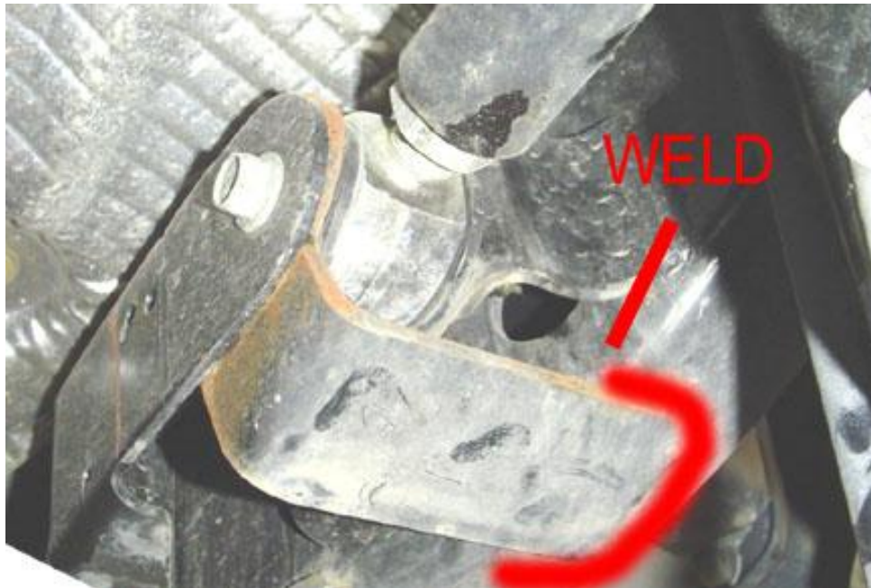
Rear Upper Reinforcing Mounts

c) Install the rear upper reinforcing mounts as shown and weld them into place on the bottom of the frame. (Passenger side shown) The new bracket goes in between the OEM bracket and where the new joint goes.