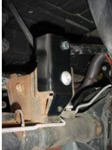
Rear Track Bar Relocation Bracket