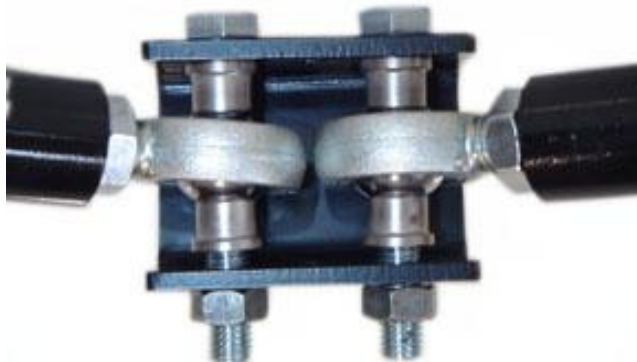
Rear Tri-Link Connection

15. For TJ and LJ X Factor Plus Only ; Install the rear upper Triangulated 4 Link Assemblies. The bushing end gets attached to the frame mounts with a 14mm x 90mm bolt, washers and nylok nut. The Krawler Joint connection gets attached to the cradle with the supplied 14mm x 100mm bolt, washers, and nylok nuts. The orientation of the arm is to be set and then the Jam nut at the frame connection is to be locked in order to hold the orientation of the arm. With the arm oriented properly the joint at the cradle then should be oriented to allow for maximum articulation and the jam nut closest to this joint should then be locked. We strongly recommend the use of red loctite on all the jam nuts to ensure they do not back off under harsh vibration. Show below is the basic assembly method and orientation of the parts as they go into the vehicle.