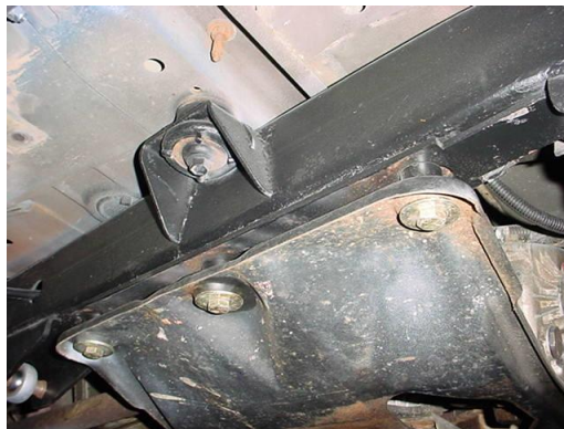
T-Case Drop Shown on TJ

Optional Transfer Case Drop Kits; Install the supplied tubular spacers between the skid plate and the frame and tighten with the supplied hardware.