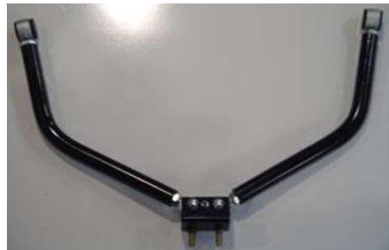
Triangulated 4 -Link Assembly