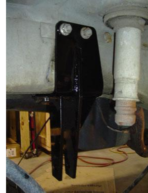
RK Track Bar Bracket Installed

14. Drill out the lower track bar mounting hole at the axle to 9/16. Install the Rock Krawler Adjustable Track Bar using the supplied 14mm x 70mm bolt, nylok nut and washers through the new track bar bracket and the mounting position at the axle.