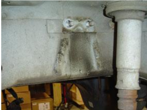
OEM Track Bar Bracket Removed