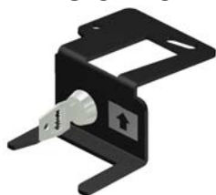
#1 Bracket, Hood Lock