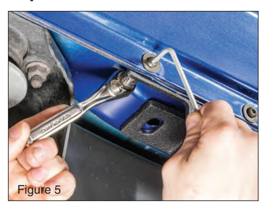
Installing Underside 10mm Bolts Under the body just under where you mounted the bracket to the pinch welds above, insert a nut plate into the opening with the nut facing upwards (Fig 6). Line up the nut on the Nut Plate with