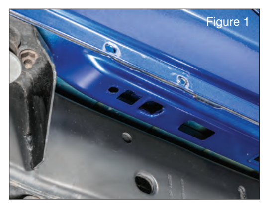
Differences in Mounting Styles Body Style "A" (Fig 1) Will use the supplied 10mm Nut Plates (inserted into the body), 10mm bolts, lock washers & flat washers.