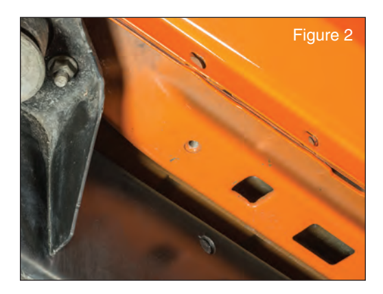
Style "B" (Fig 2) will use the supplied 8mm x 35mm bolts (threaded into body), lock washers and 8mm x 28mm OD x 3mm thick Larger Flat washers.