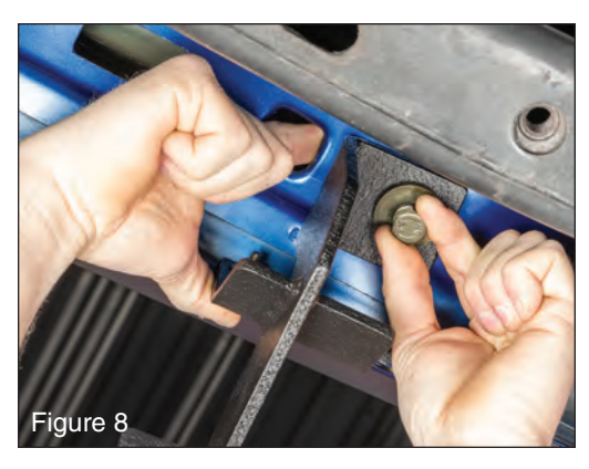
Use the 10mm socket, extention and ratchet to tighten up the 10mm bolt as shown in Figure 9.