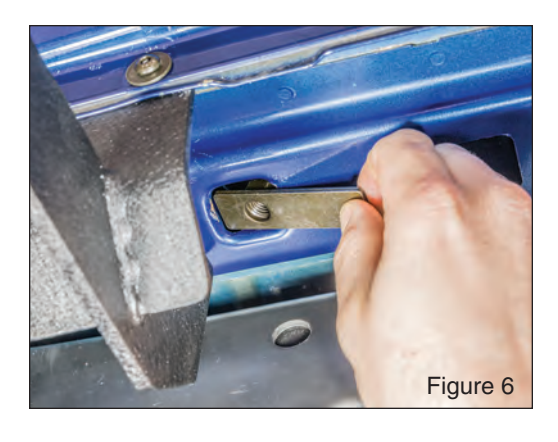
the hole in the Bracket. Bolt the Bracket to the Nut Plate with (1) 10mm x 35mm Hex Bolt, (1) 10mm Lock Washer and (1) 10mm Flat Washer, (Fig 8 & 9).