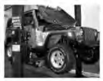
Step 6: Lift vehicle

Note: If vehicle is getting light guards, turn in headlight adjustment screws six full turns. See Chapter Accessories/ Light guards for more information